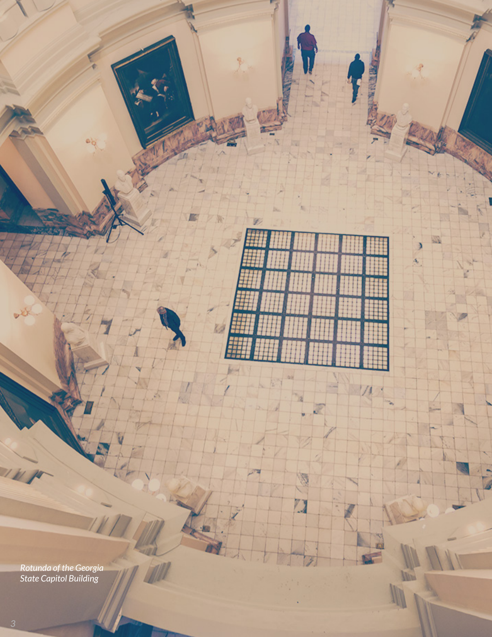
Rotunda of the Georgia State Capitol Building