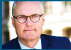
CASEY CAGLE Lt. Governor