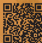
Access the Map Viewer

Key users include national and regional water authorities, water resources managers, hydroelectric power companies, civil protection and first line responders, international humanitarian aid organisations and the EU's Emergency Response Coordination Centre (ERCC).