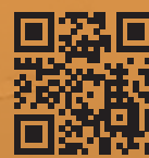
Also available for Europe as EFAS