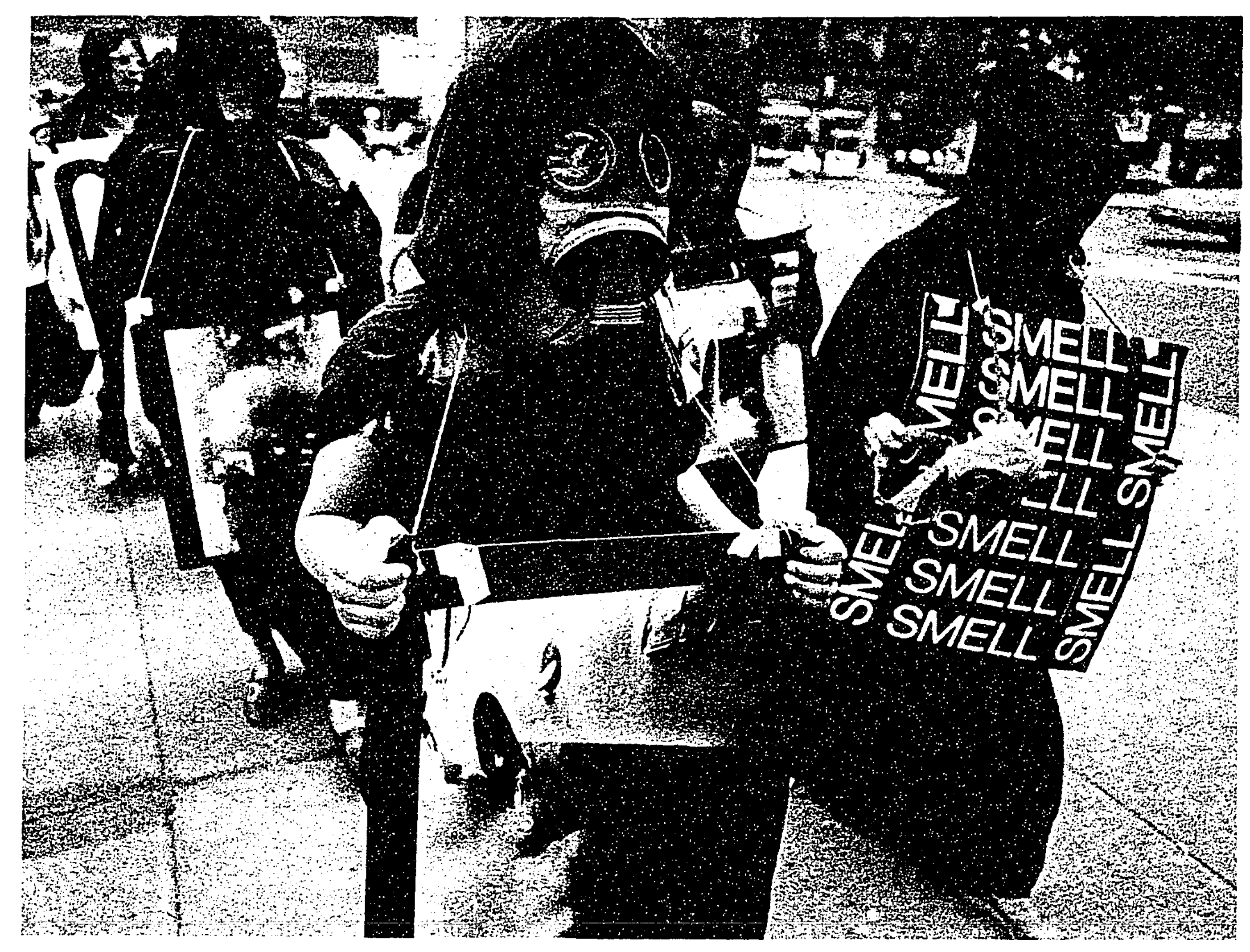
DEMAND-A demonstration in New York. The doctrine of "social responsibility," says the author, would require an executive "to make expenditures on reducing pollution beyond the amount that is in the best interests of his corporation or required by law."

HAVE, for simplicity, concentrated on the special case of the corporate executive, except only for the brief digression on trade unions. But precisely the same argument applies to the newer phenomenon of calling upon stockholders to require corporations to exercise social respon-