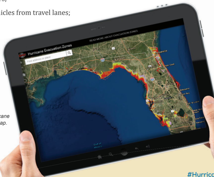
Example of a Hurricane Evacuation Zone Map.