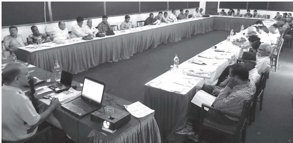
Media owners and professional organizations participating in a dialogue on journalist safety protocol in Biratnagar on July 30

Similarly, in the level of policies and practices, the following were suggested: