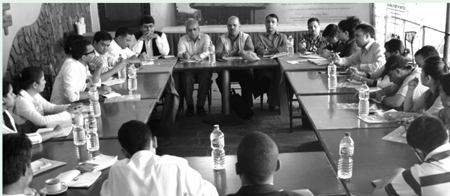
Stakeholders discussing RTI and management of crisis information

Nepal witnessed a huge loss of lives and destruction of properties in the recent earthquakes – the major one striking the