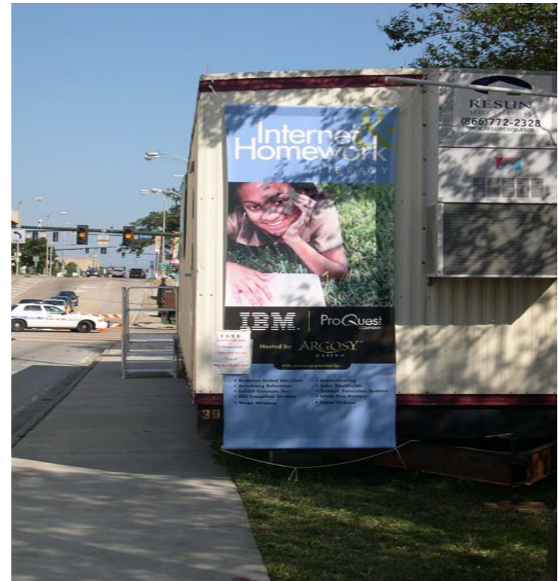
Temporary public library in Louisiana after Hurricane Rita