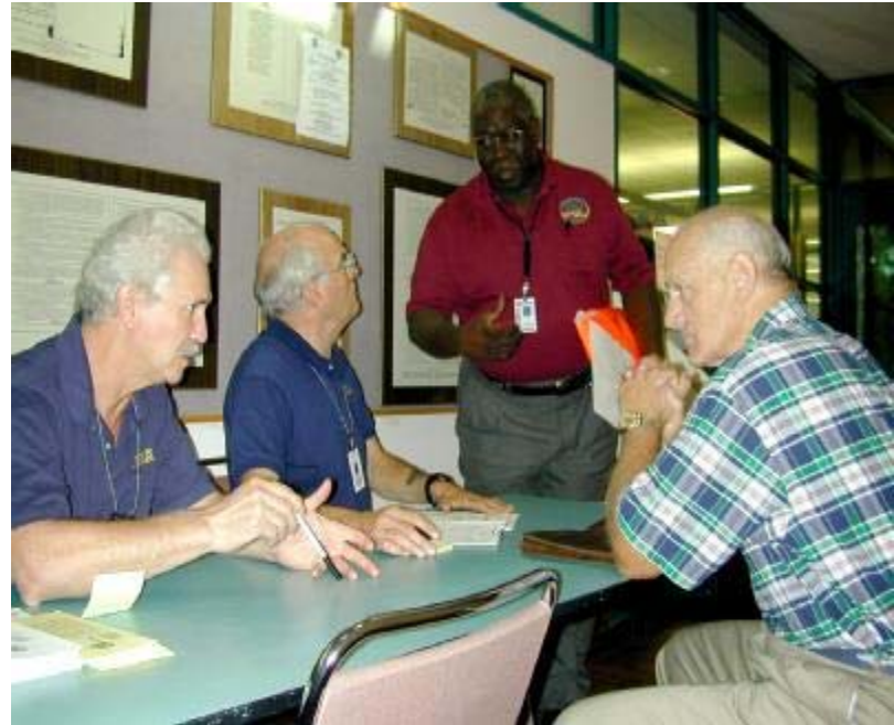
Vero Beach, FL, December 2, 1999 -- Federal Emergency Management Agency and Florida emergency management officials confer with a resident at the County Library DRC.