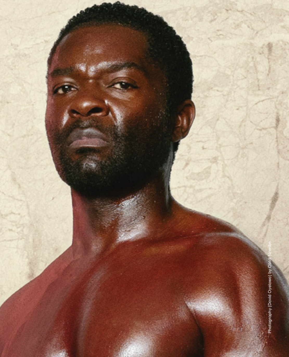
Photography (David Oyelowo) by Obidi Nzeribe.