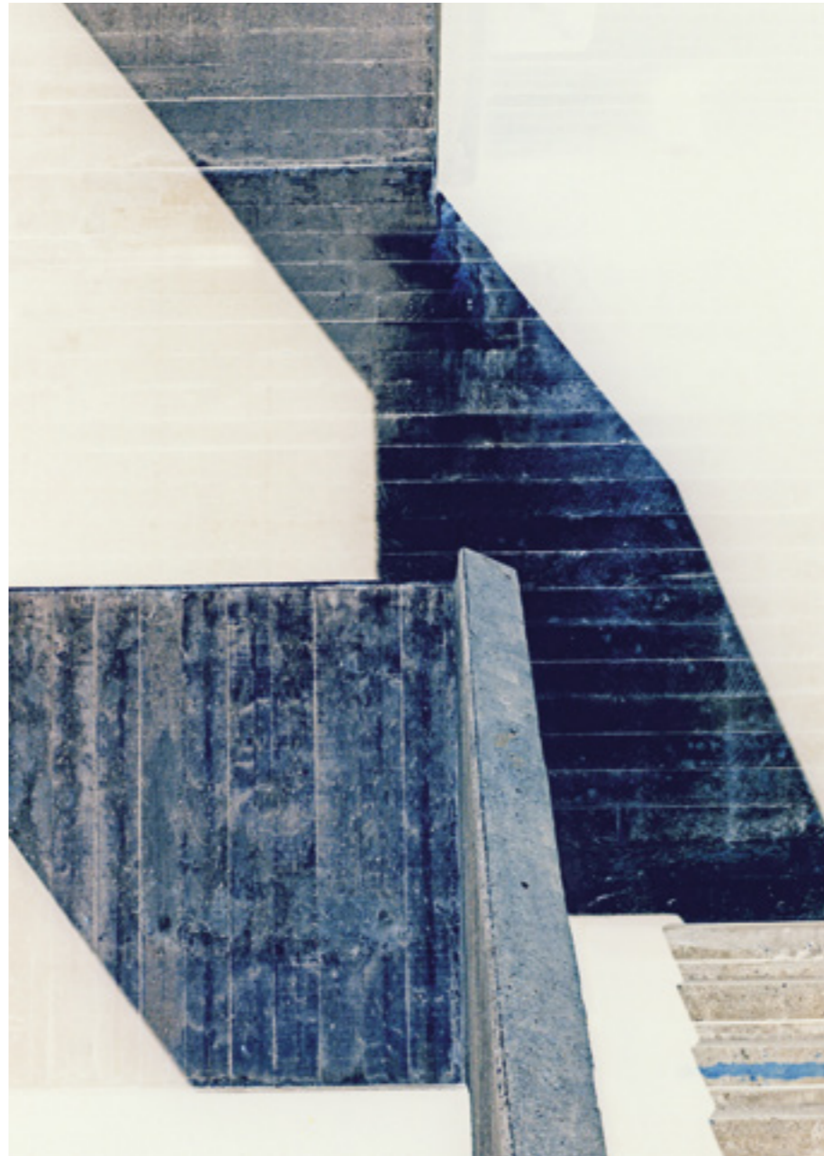
Stairwell (National Theatre) by Amelia Lancaster.