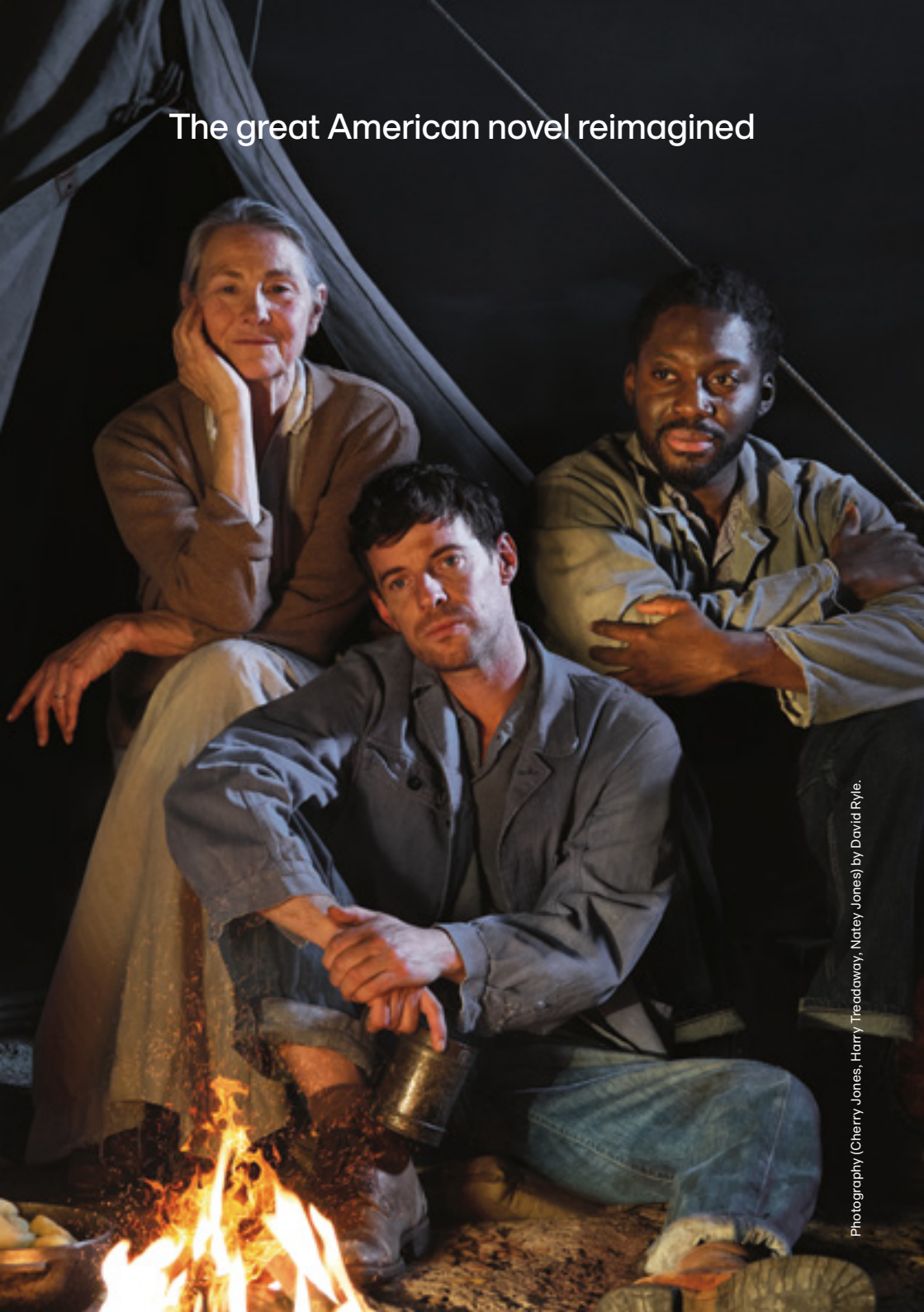
Photography (Cherry Jones, Harry Treadaway, Natey Jones)