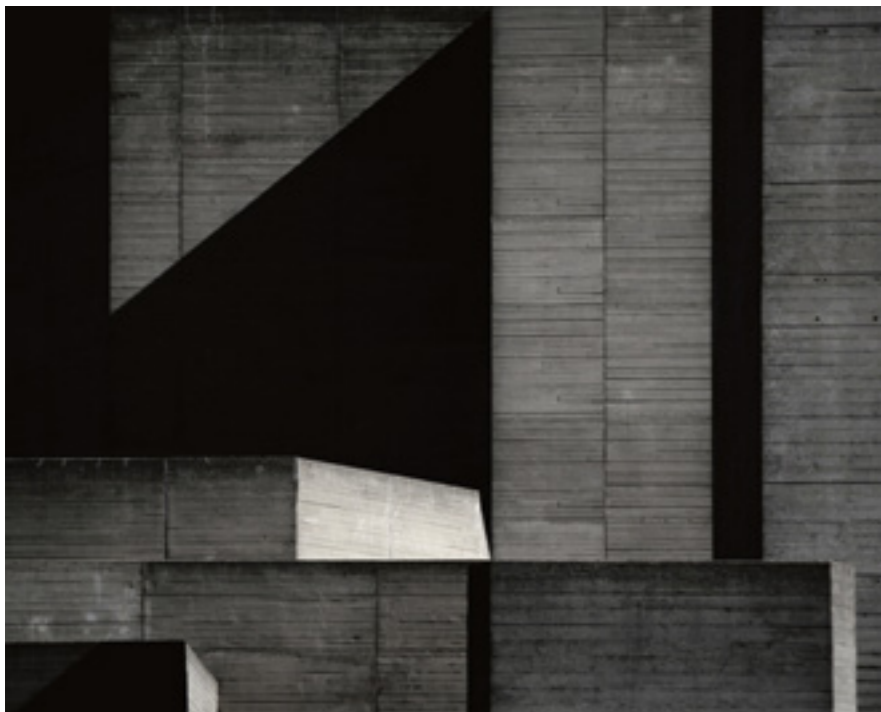
Beautiful Brutalism (National Theatre I) by Amelia Lancaster.

Open during building opening hours, check website for more nationaltheatre.org.uk