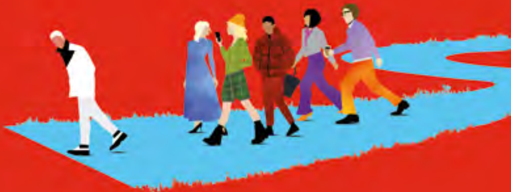
Illustration by AKA NY.