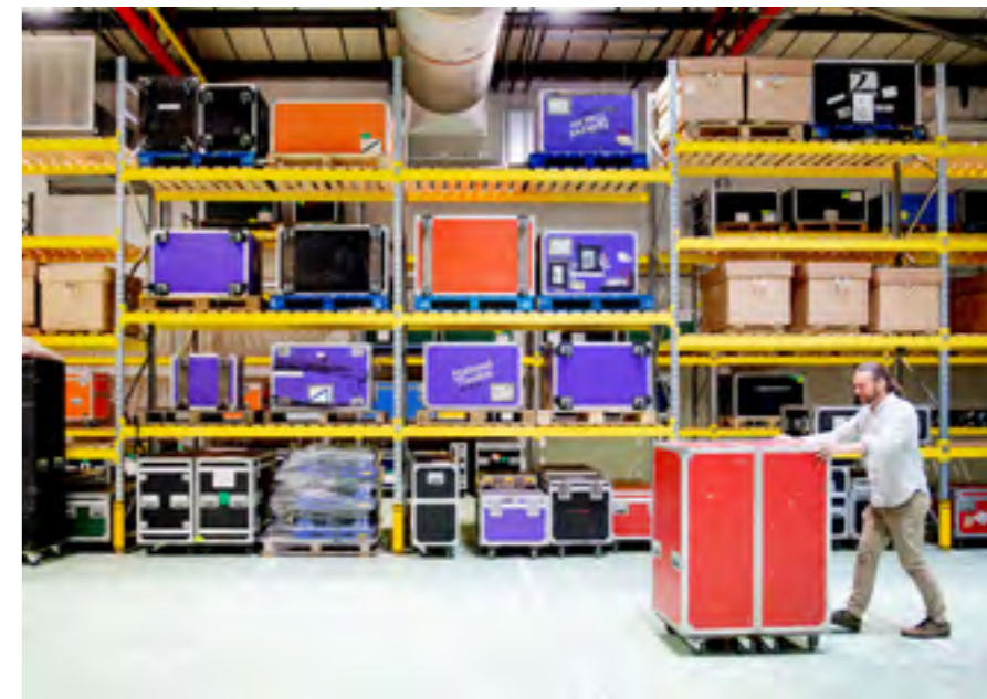
Green Store photography by Peter Goding.