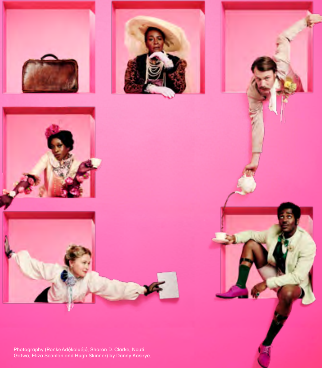
Photography (Ronke Adékoluéjé, Sharon D. Clarke, Ncuti Gatwa, Eliza Scanlan and Hugh Skinner)