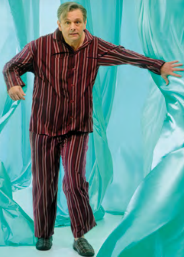
Photography (Michael Sheen)