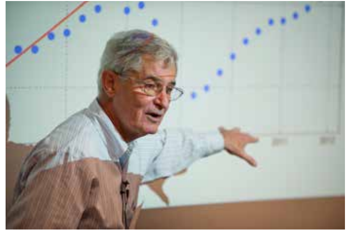
Robert Lucas, John Dewey Distinguished Service Professor Emeritus in the Department of Economics and the College, speaks at a Friedman Forum Undergraduate Lecture.

We developed further the three specific strategies identified in the original proposal with the goal of fostering productive interactions and collaborations across disciplines and generations: