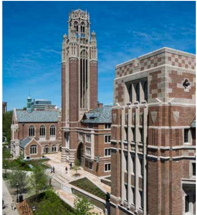
Saieh Hall for Economics