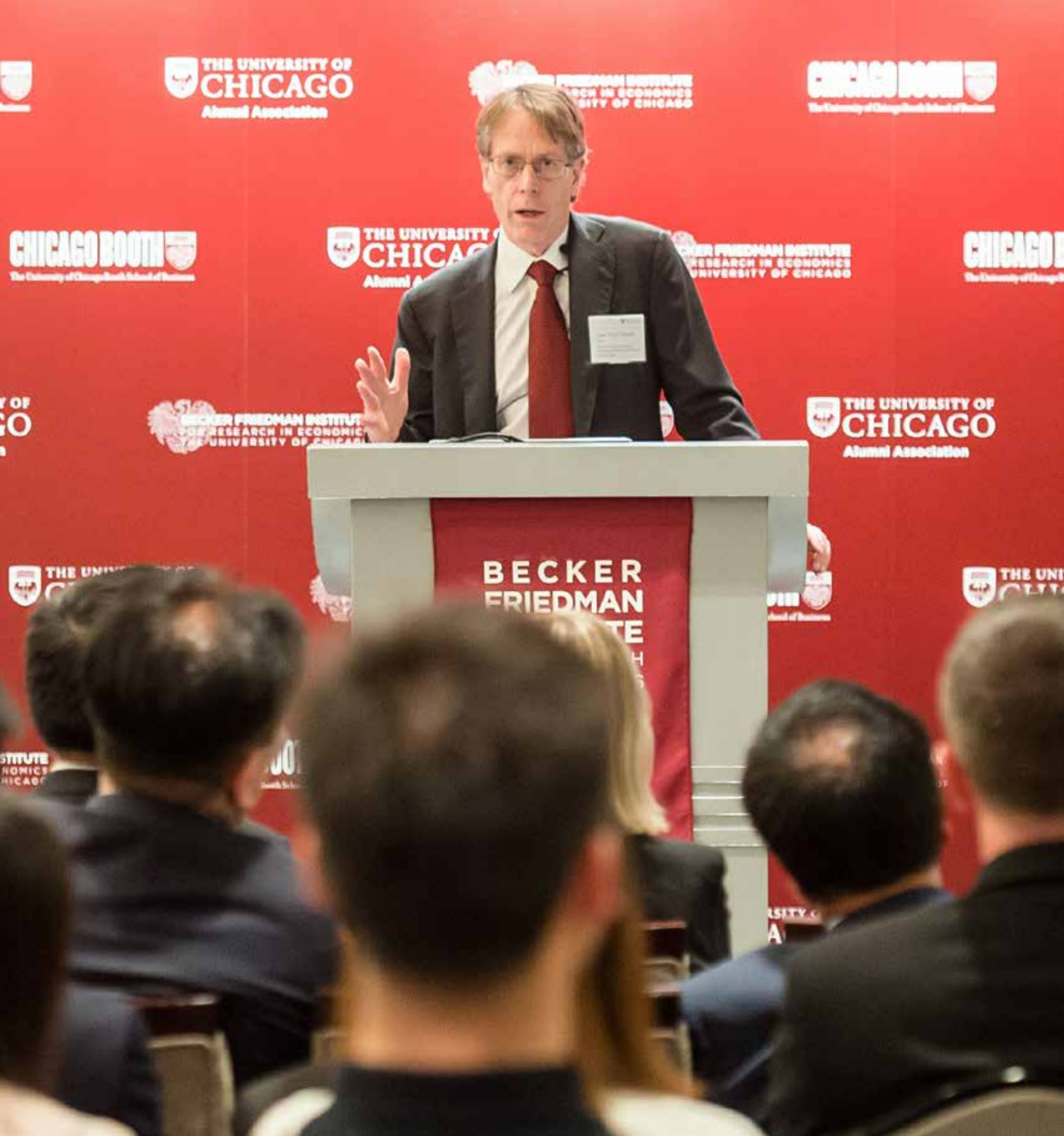
Lars Peter Hansen, BFI Research Director, gives a lecture in Hong Kong in 2014.