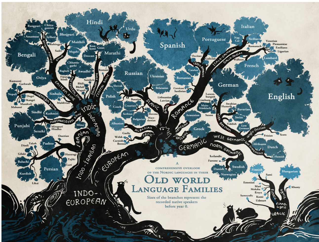
Figure 3.1: Indo-European Family of Languages [74]

Languages differ greatly from each other in their their sentence structure (syntax), word structure (morphology), sound structure (phonology) and vocabulary (lexicon). These differences allow us to classify languages into families: in fact, one may visualize languages as a tree, as the artist Minna Sundberg did: