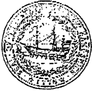
JOHN H. LYNCH Governor