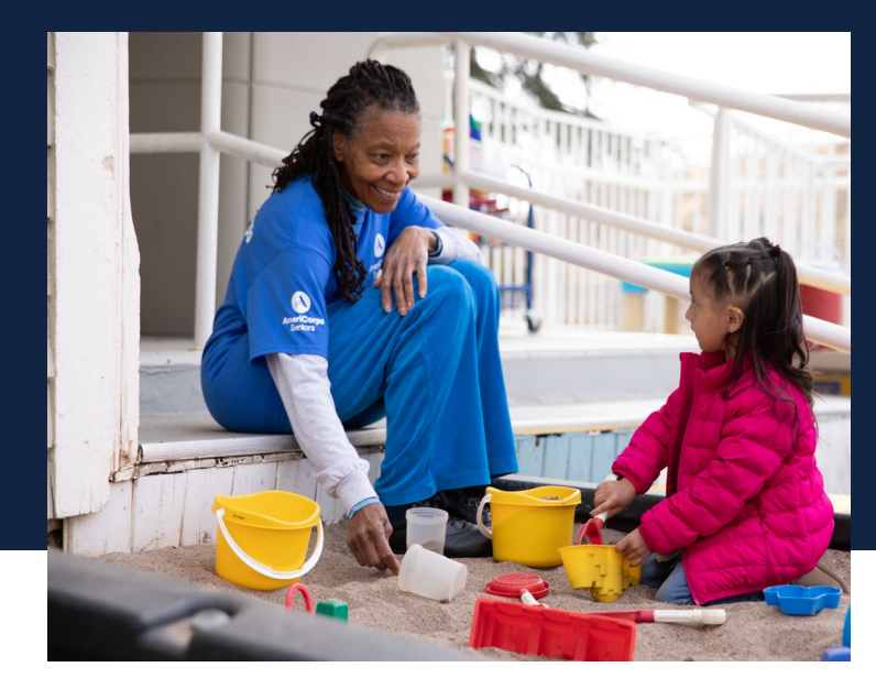
How you'll serve