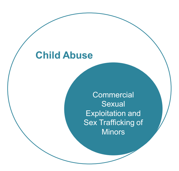
FIGURE 1 Commercial sexual exploitation and sex trafficking of minors are forms of child abuse.

NOTE: This diagram is for illustrative purposes only; it does not indicate or imply percentages.