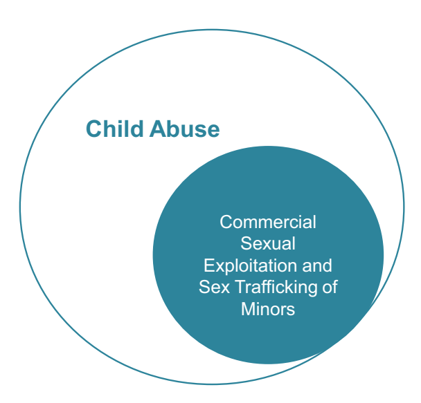
FIGURE 1 Commercial sexual exploitation and sex trafficking of minors are forms of child abuse.

NOTE: This diagram is for illustrative purposes only; it does not indicate or imply percentages.