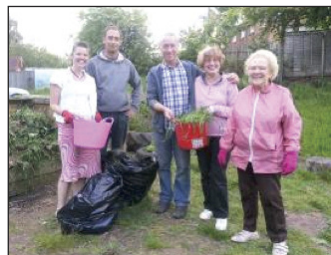
Running gardening groups and volunteer sessions

We have installed gym equipment, 3 large murals celebrating the park, a temporary public toilet during spring/summer months, set up and run a community composting facility, a wildflower bank, maintained a pond and other wildlife habitats, run Saturday yoga sessions, and locked and unlocked gates each day (to minimise late night anti-social behaviour). We also run 3-5 large, successful events per year, and celebrated the site's history as an old railway line.