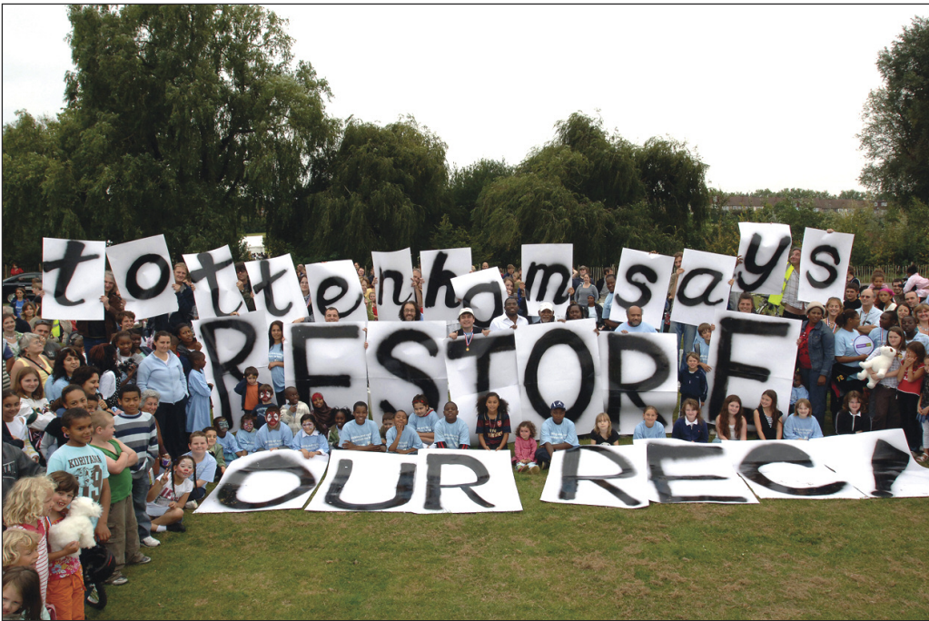
Launching regeneration efforts

more active involvement and support, for example fundraising (36%), community engagement (35%) and use of IT/Tech (26%).