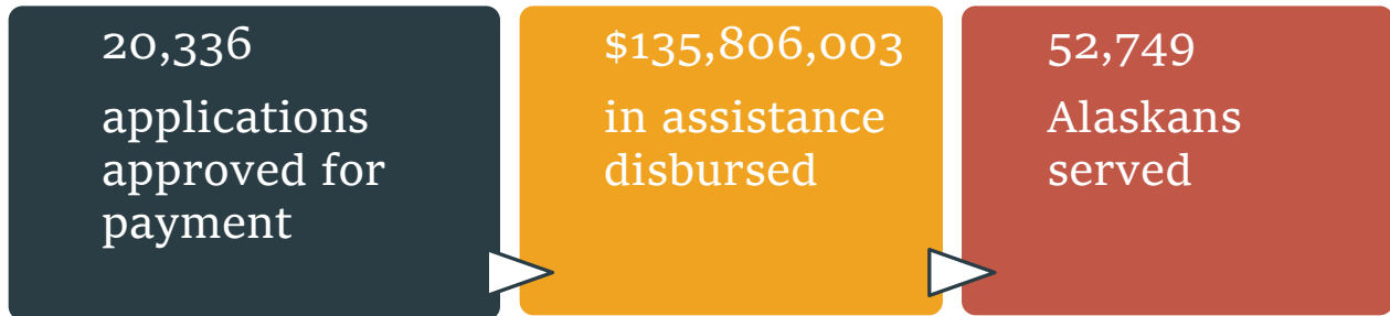
Figure 2: ERA1 distribution statistics on 9/24/21, www.ahfc.us

As of September 24, 2021, AHFC’s dashboard lists the following statistics: