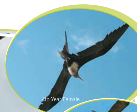
4th Year Female