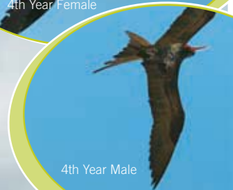
4th Year Male