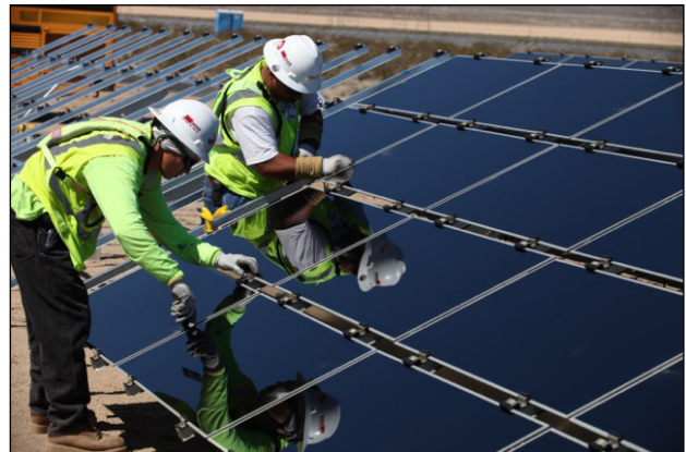
Silver State Solar - Nevada

PLF Position: The PLF on January 27, 2022 provided comments to BLM on the proposed guidance to reduce rental rates for solar and wind energy authorizations on the public lands. The PLF will continue to track the development of any proposed rule.