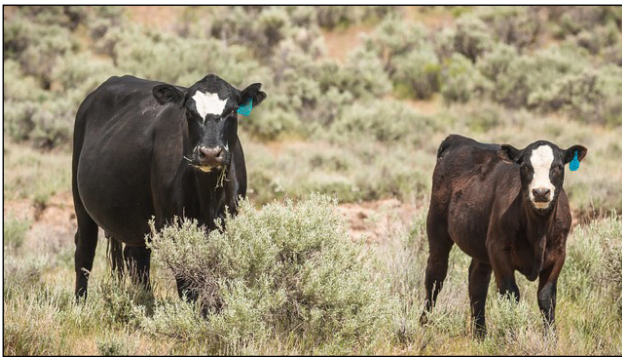
Livestock grazing - Oregon

PLF Position: The PLF on February 24, 2020 provided comments to BLM in response to the Notice of Intent to prepare an EIS to support proposed revisions to the grazing regulations. The PLF on June 18, 2020 also co-signed a collaborative letter with other organizations to BLM providing comments on proposed revisions to the grazing regulations. The PLF will continue to track the development of the proposed regulations and provide comments as appropriate.