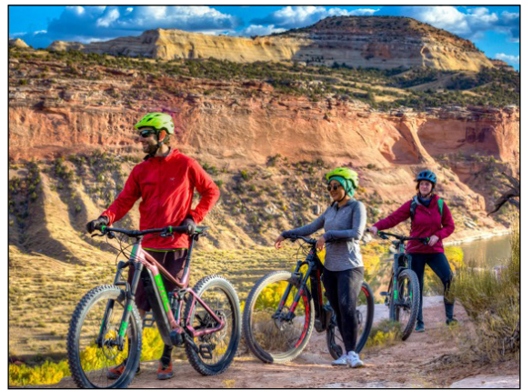
E-bikes

Mark your calendar for our IN-PERSON Annual Meeting this year in Grand Junction, Colorado on September 20-23, 2022. It has been more than two years since we have been able to meet face-to-face and we are going to have all kinds of fun. The theme for this year's meeting is "Managing E-bike Use on Non-motorized Trails," which has become an interesting challenge for BLM since the off-highway vehicle regulations were amended. We have reserved an E-bike ride just for you!