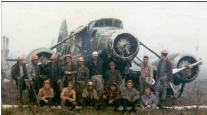
Stinson 1968

I am looking forward to the day I can travel to Mt. Pleasant, TX and touch the Stinson airplane that has such a warm memory in my heart. I had no idea during my fire crew experiences with BLM in Alaska during the summer of 1968, that it would later lead to a long-term career with BLM. The memories of the Stinson Tri-Motor only add to those experiences.