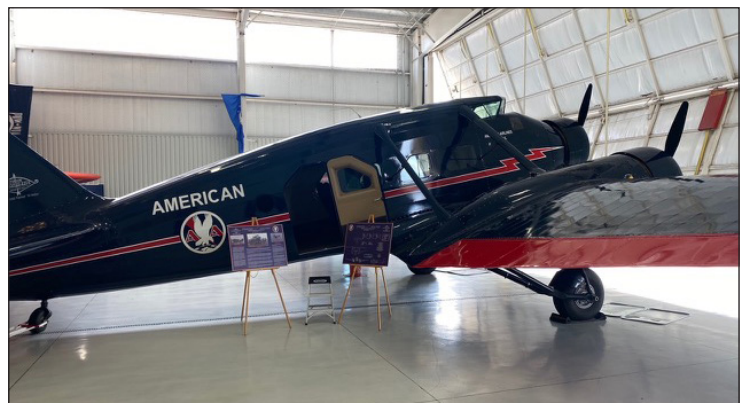
Stinson 2021