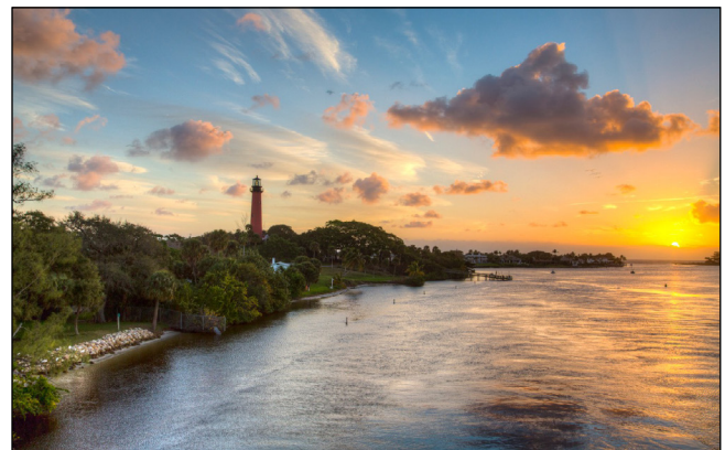
Jupiter Inlet Lighthouse Outstanding Natural Area

In 2008, Congress passed legislation that designated this remarkable site as the Jupiter Inlet Lighthouse Outstanding Natural Area to protect the unique scenic, scientific, educational, and recreational values of the area. The lighthouse is part of the BLM National Landscape Conservation System and is one of only three sites afforded the Outstanding Natural Area designation. Today, this unlikely spy station welcomes some 80,000 visitors each year—many who have no idea of the lighthouse's James Bond past.