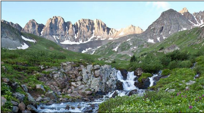
American Basin ACEC – Colorado

PLF POSITION: The PLF will review the Proposed Rule and provide comments as appropriate.