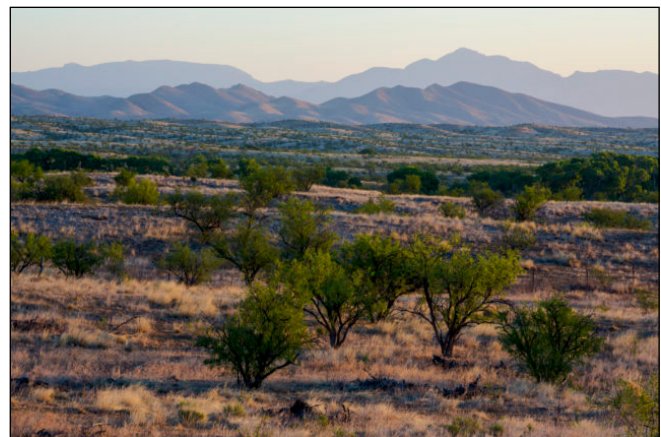
Las Cienegas National Conservation Area, AZ