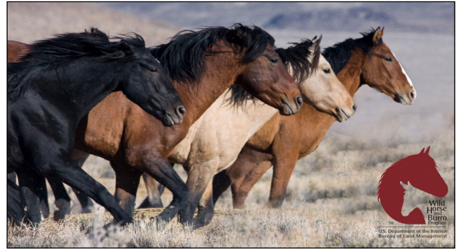
Wild Horses on the Public Lands

If you are an existing member, we encourage you to reach out to a family member, friend, former colleague, or current BLM employee to join the PLF or renew their membership. If you are not a member, we encourage you to visit our website at www.publicland.org . There you can find out more about who we are and what we do. You can also click the membership banner and join us on our journey!