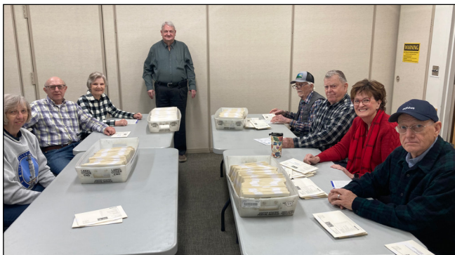
PLF Monitor Mailing Party, March 10, 2023

We wish to thank those PLF members in the Washington, D.C. area that gathered each quarter to assemble and label the Monitor for mailing purposes. These PLF members gathered for a last “mailing party” of the Winter 2022 / 2023 edition of the Monitor on March 10, 2023.