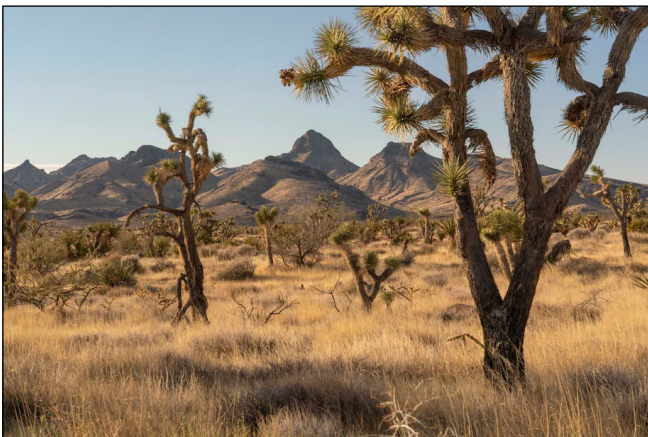
Avi Kwa Ame National Monument – Nevada

This newest BLM National Monument becomes part of the BLM National Landscape Conservation System (NLCS) of special management areas and will create an important wildlife corridor of protected lands connecting the existing Mojave National Preserve, the Castle Mountains National Monument, the Mojave Trails National Monument, the Dead Mountain Wilderness Area in California, and the Lake Mead National Recreation Area along the Colorado River.