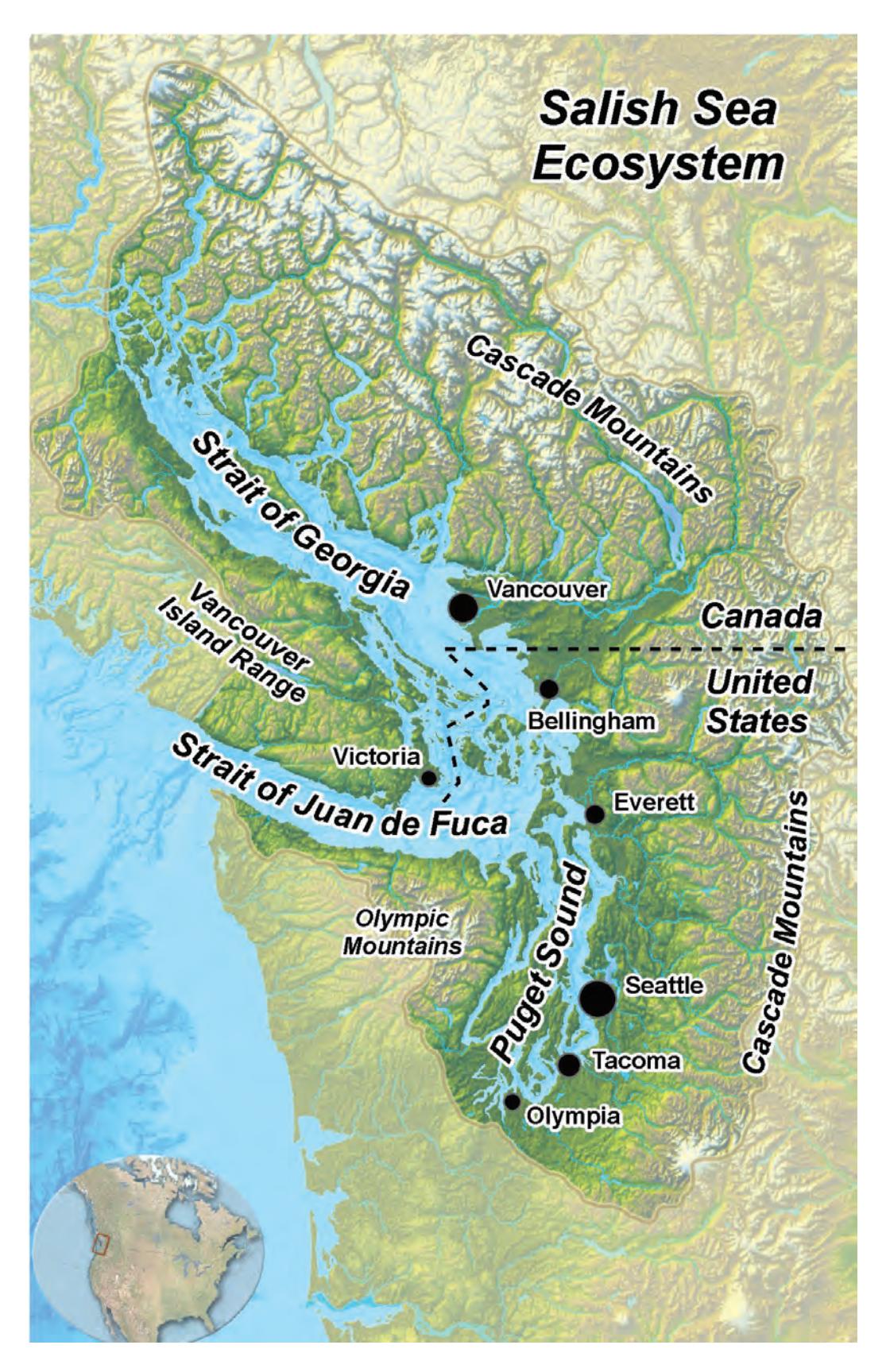
Figure 1. The Salish Sea Ecosystem showing marine waters in the Straits of Georgia and Juan de Fuca, and Puget Sound, and the surrounding watersheds. (Adapted from Stefan Freelan; accessed November 2009, at http://myweb.facstaff.wwu.edu/~stefan/SalishSea.htm).