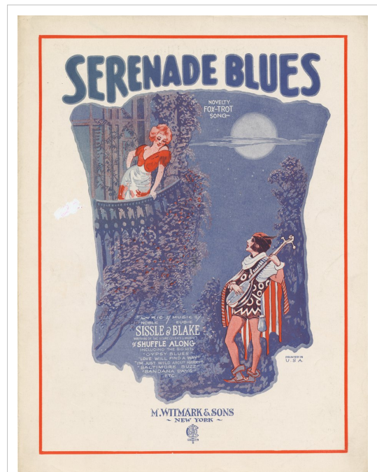
Blues progressions influenced a great deal of 20th century American popular music