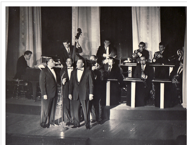
The Mills Brothers' recording of "Till Then" looked forward both to the end of World War II and to the popular music of the 1950s.

Another common way of extending the I - IV - V sequence is by adding the chord of the sixth scale degree, giving the sequence I - vi - IV - V or I - vi - ii - V, sometimes called the 50s progression.