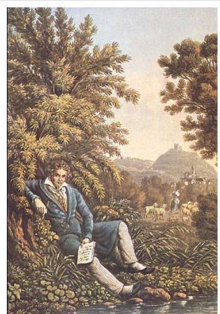
Beethoven imagined composing his Pastoral Symphony