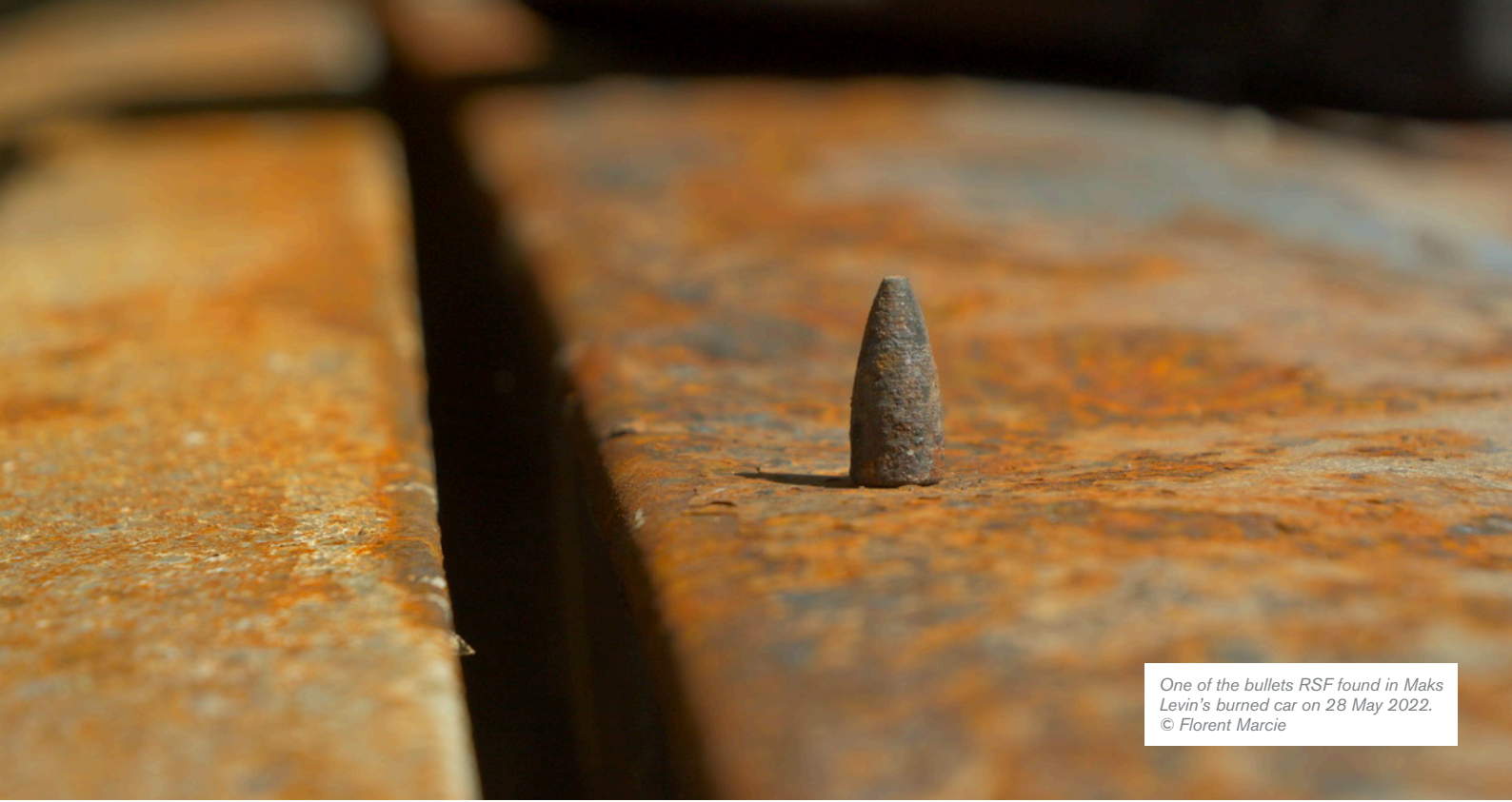
One of the bullets RSF found in Maks Levin's burned car on 28 May 2022.

During the first visit on 26 May, a three-hour search starting from the car's last recorded GPS point failed to locate the crime scene. But a second search two days later, on 28 May, did locate it. These were our observations: