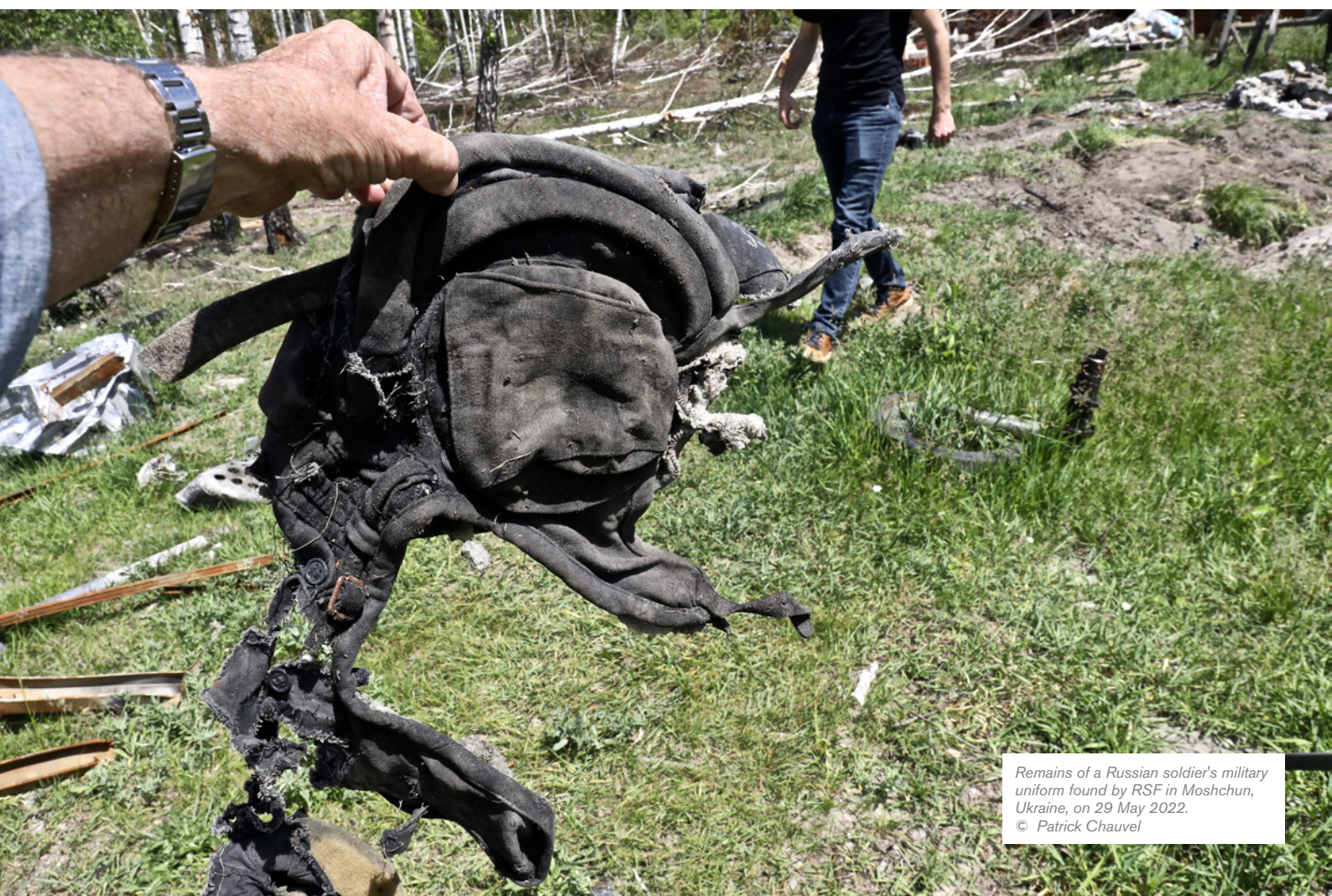
Remains of a Russian soldier's military uniform found by RSF in Moshchun, Ukraine, on 29 May 2022.