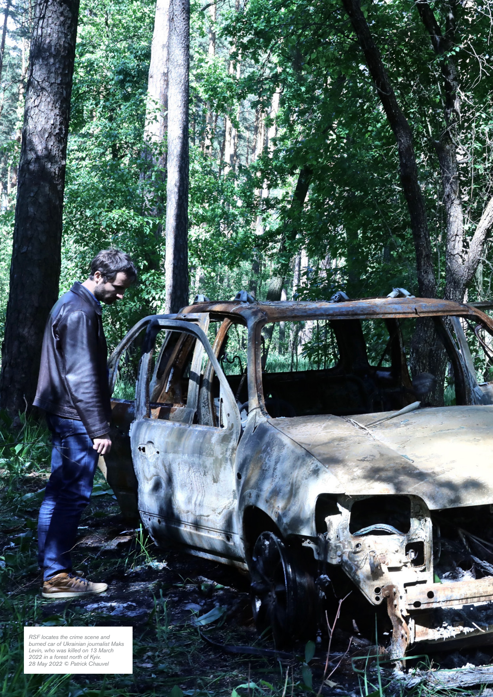
RSF locates the crime scene and burned car of Ukrainian journalist Maks Levin, who was killed on 13 March 2022 in a forest north of Kyiv. 28 May 2022