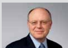
Ian C. Read (1) President and Chief Executive Officer, Pfizer Inc.