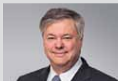
Michael S. Brown, M.D. (4, 6) Distinguished Chair, Biomedical Sciences, Regental Professor, University of Texas Southwestern Medical Center