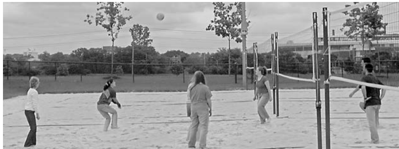
Statisticians and volleyball — it doesn't get any better than this!

There will be a dinner on Monday, August 6, 2001 , at the Atlanta Joint Statistical Meetings for department alumni and friends. The details concerning dinner location, departure place and time will be announced soon on the department web site, www.stat.ohio-state.edu , and by letter to all alumni.