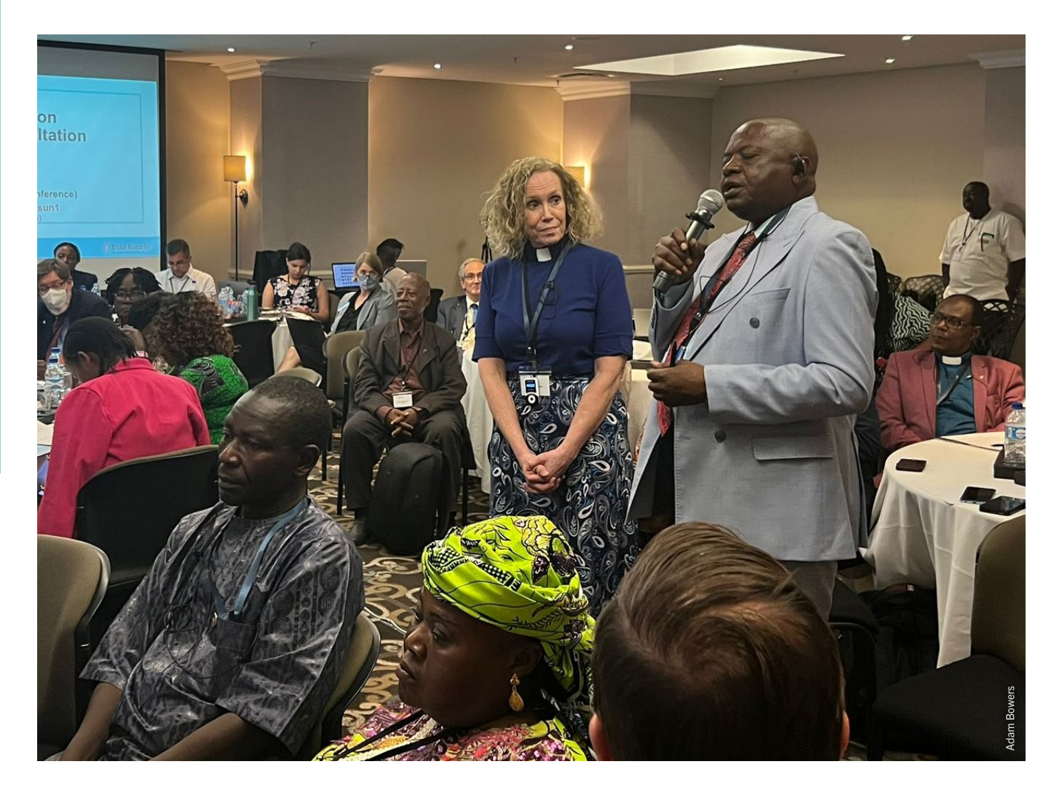
The Africa Mission Partners Consultation was the first held in several decades. It brought together African UMC bishops, representatives from each African UMC annual conference, members of the Global Ministries executive committee of the board, senior staff members and aguests for high-level conversations about the future of United Methodist mission in Africa with the goal of coming to a more integrated vision.