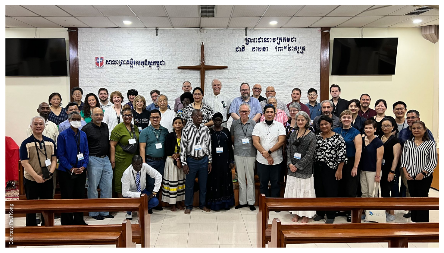
The United Methodist Mission in Cambodia hosted Global Ministries in Phnom Penh for the October board meeting. Both board meetings in 2023 were held outside of the U.S., a first for Global Ministries.