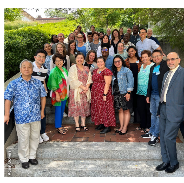
In the "Guiding Principles of Missionary Service" consultation held at Emory University's Candler School of Theology in Atlanta, Ga., Global Ministries convened a group of missionaries, mission staff, board members and ecumenical partners to reexamine and renew its practices of missionary sending.