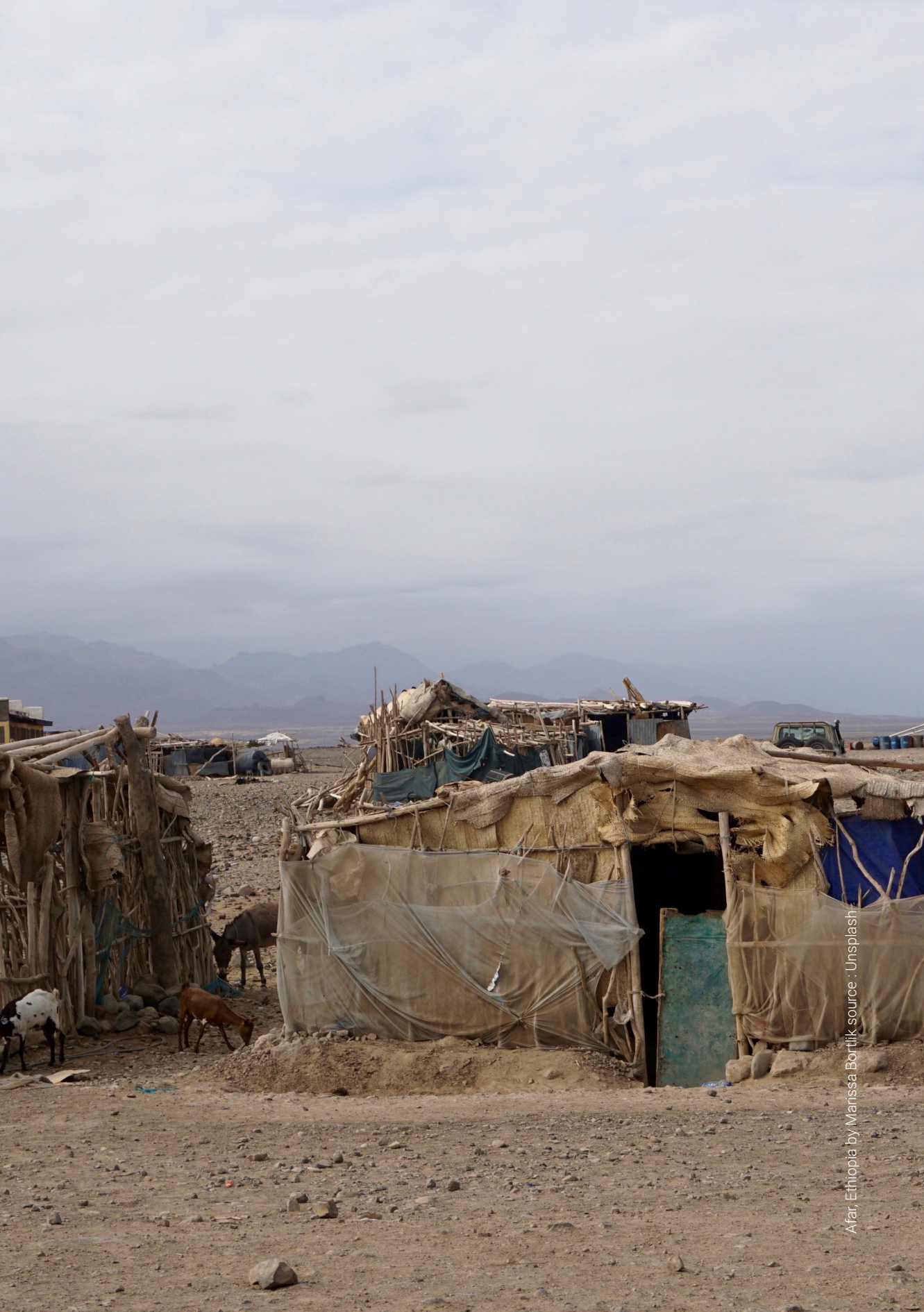
Afar, Ethiopia by Manissa Bortlik source : Unsplash