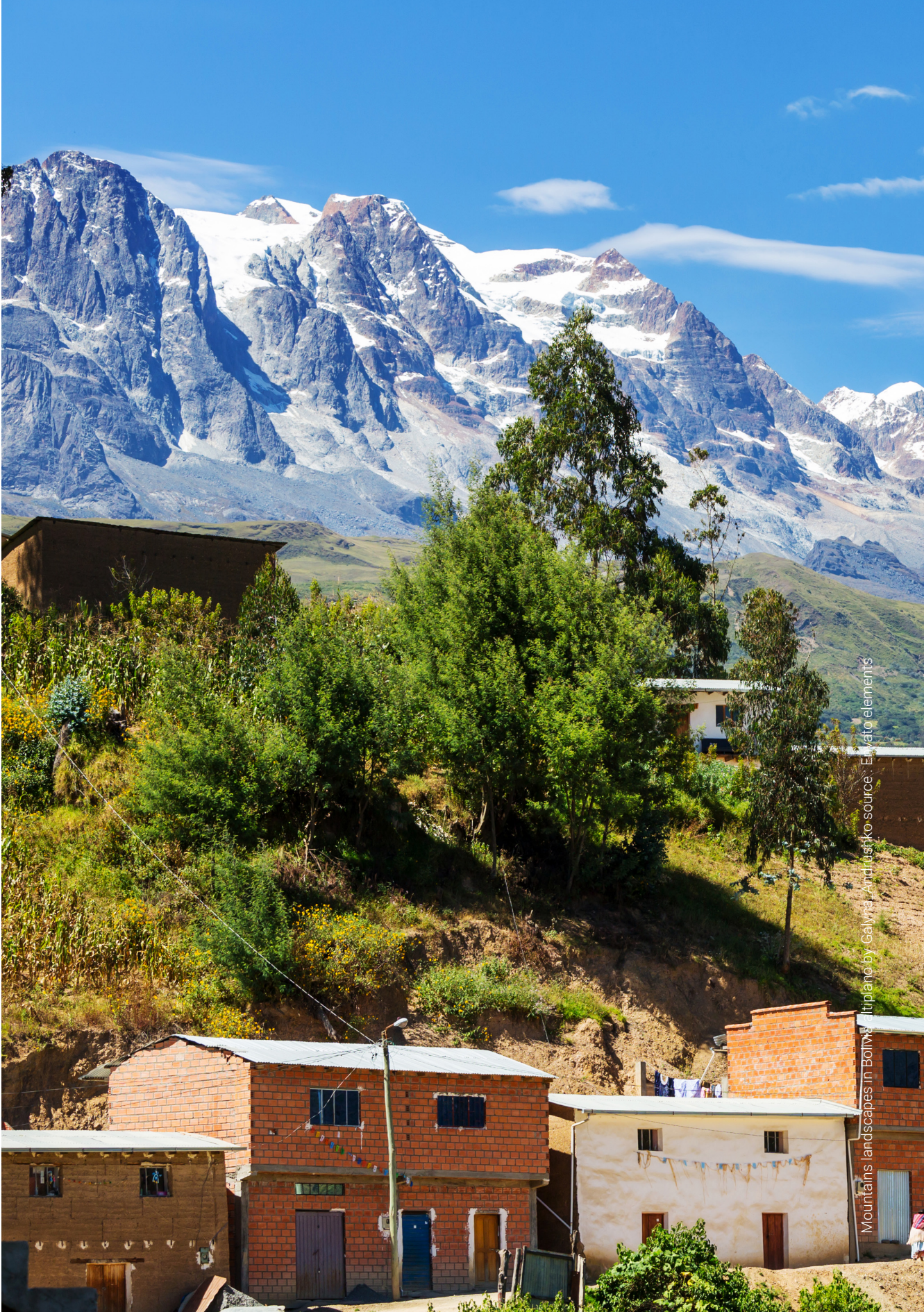
Mountains landscapes in Bolivia. Itiplano by Galyna Andriushko source: Envato elements