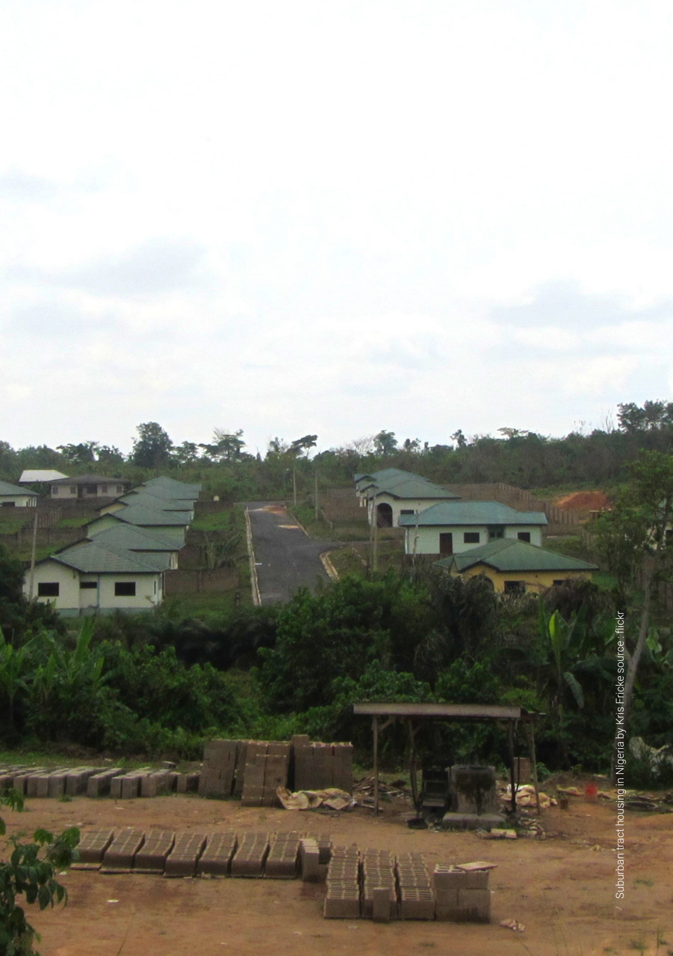
Suburban tract housing in Nigeria