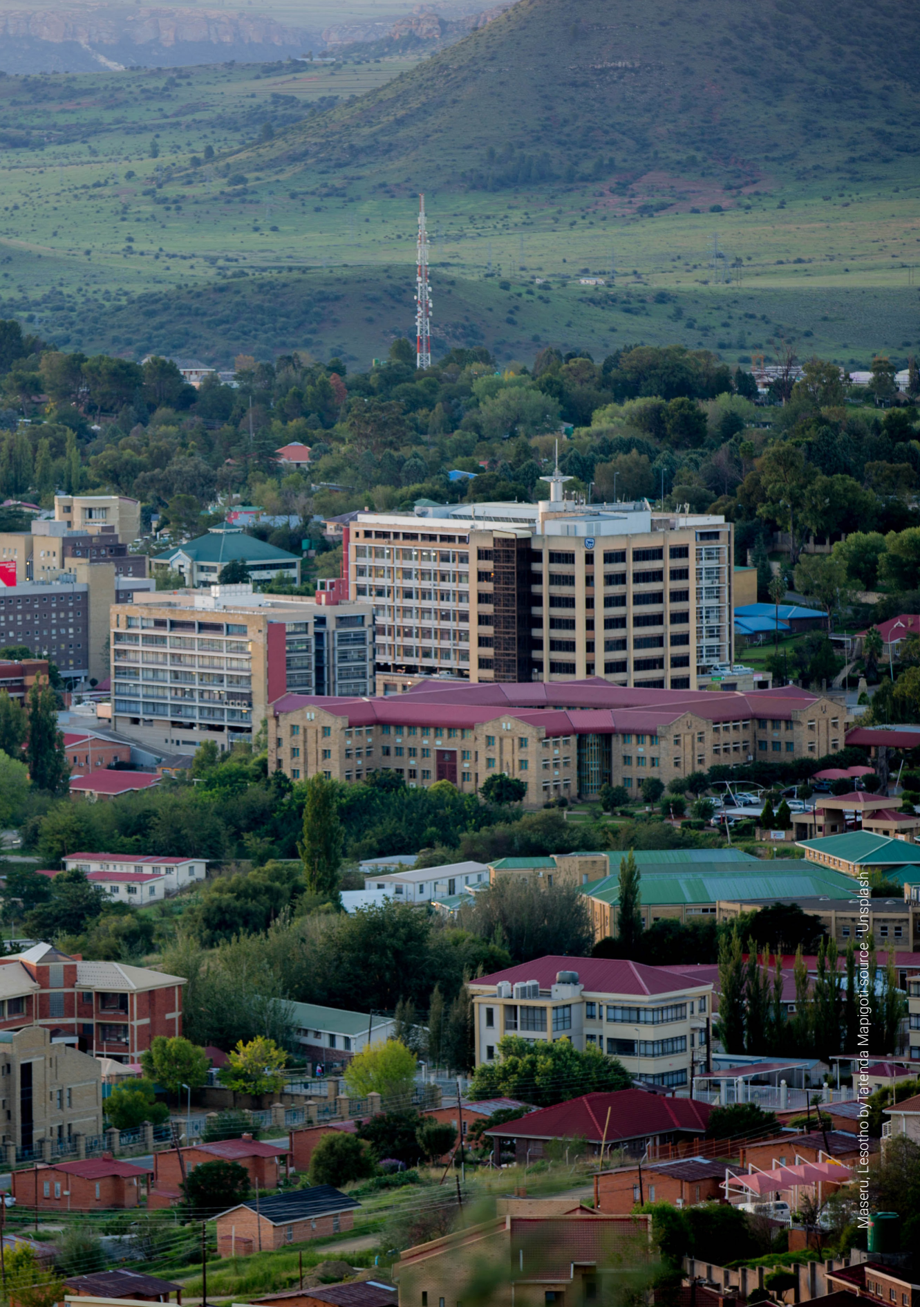
Maseru, Lesotho