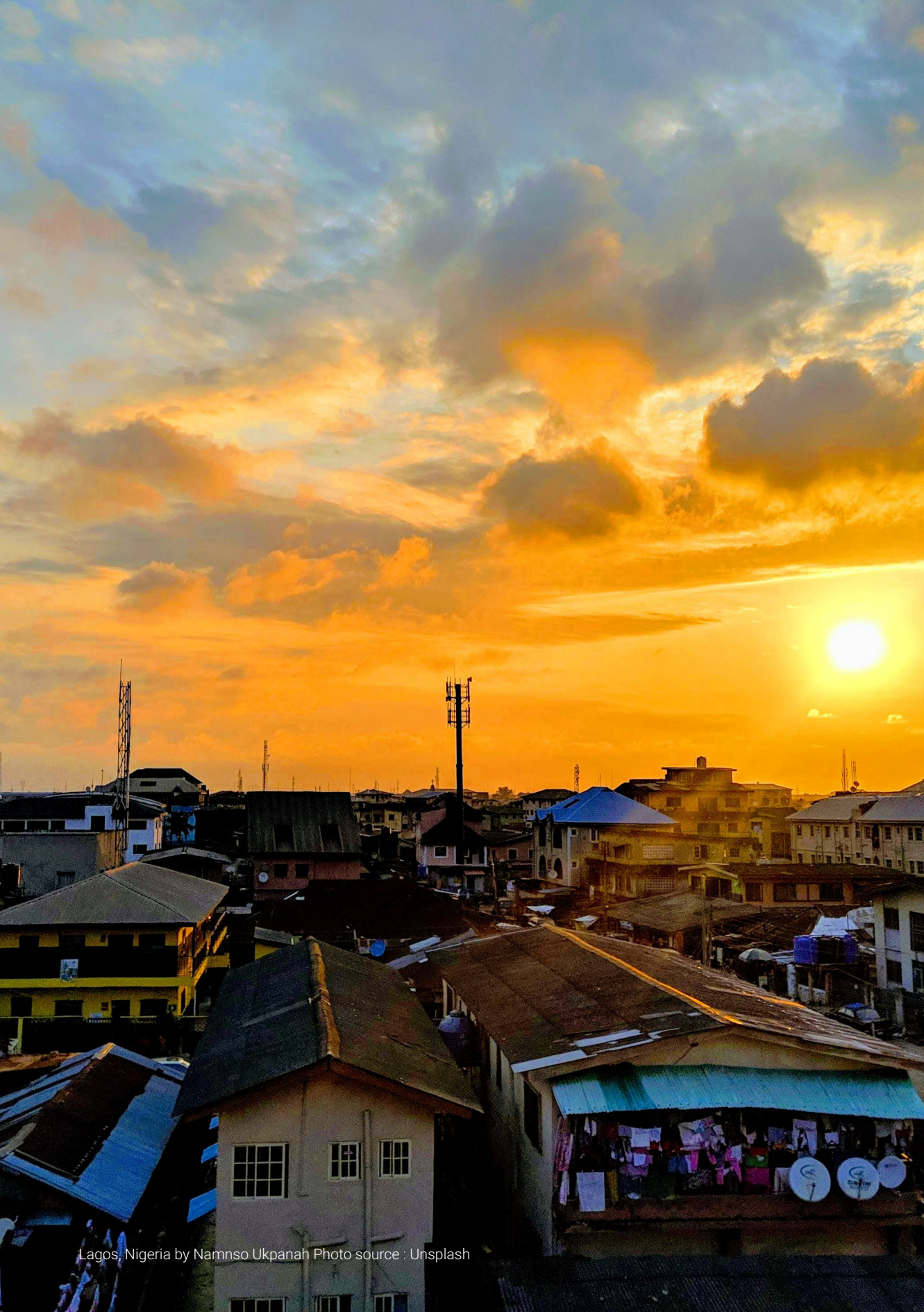
Lagos, Nigeria by Namnso Ukpanah Photo source : Unsplash