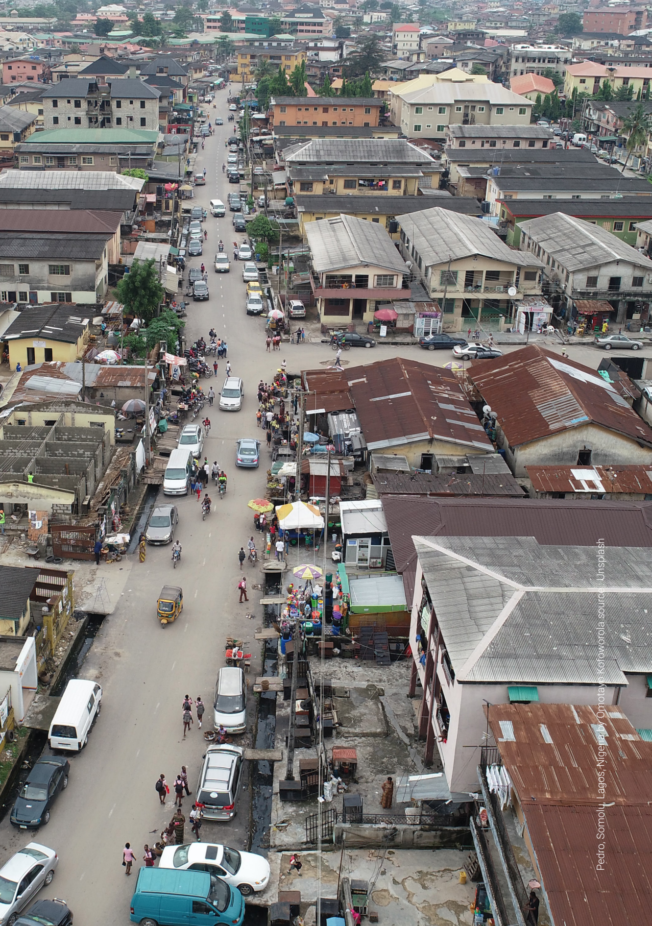
Pedro, Somolu, Lagos, Nigeria