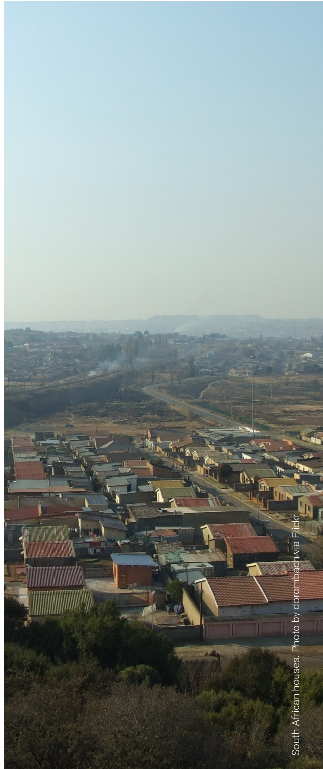
South African houses.