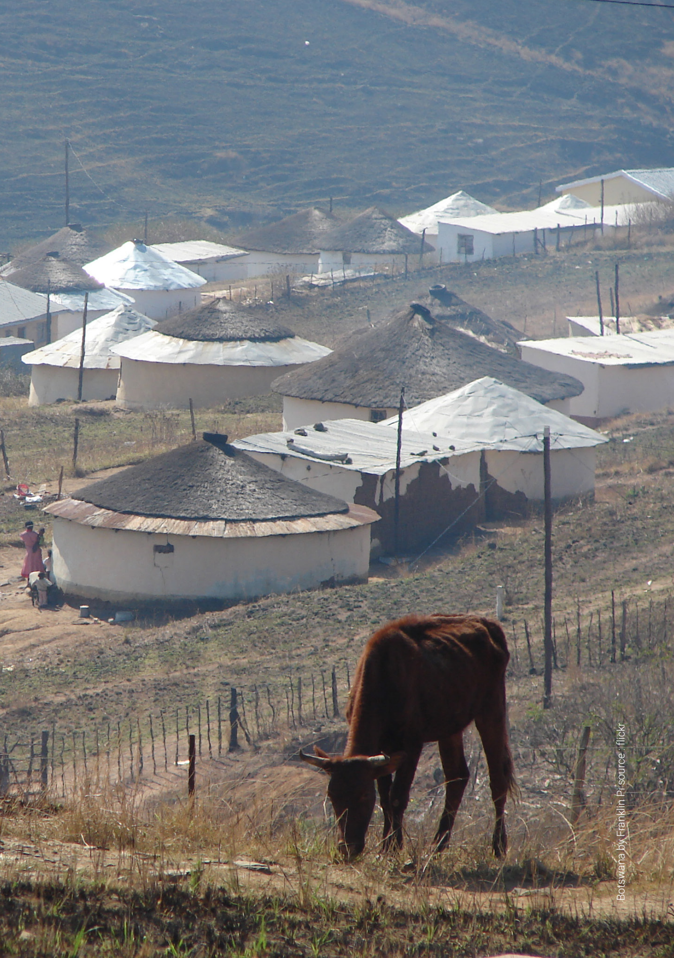
Botswana by Franklin Pi source: flickr