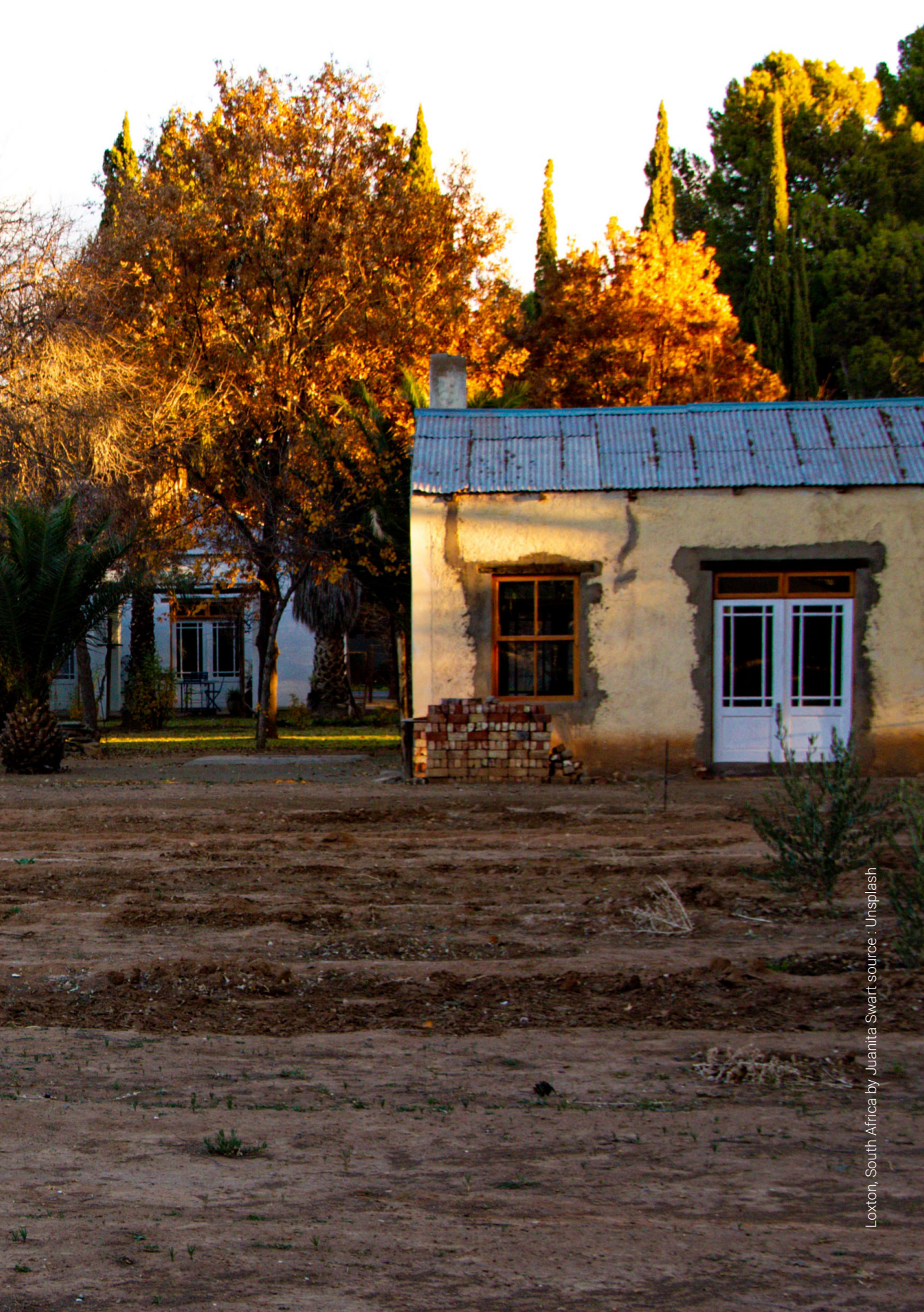
Loxton, South Africa