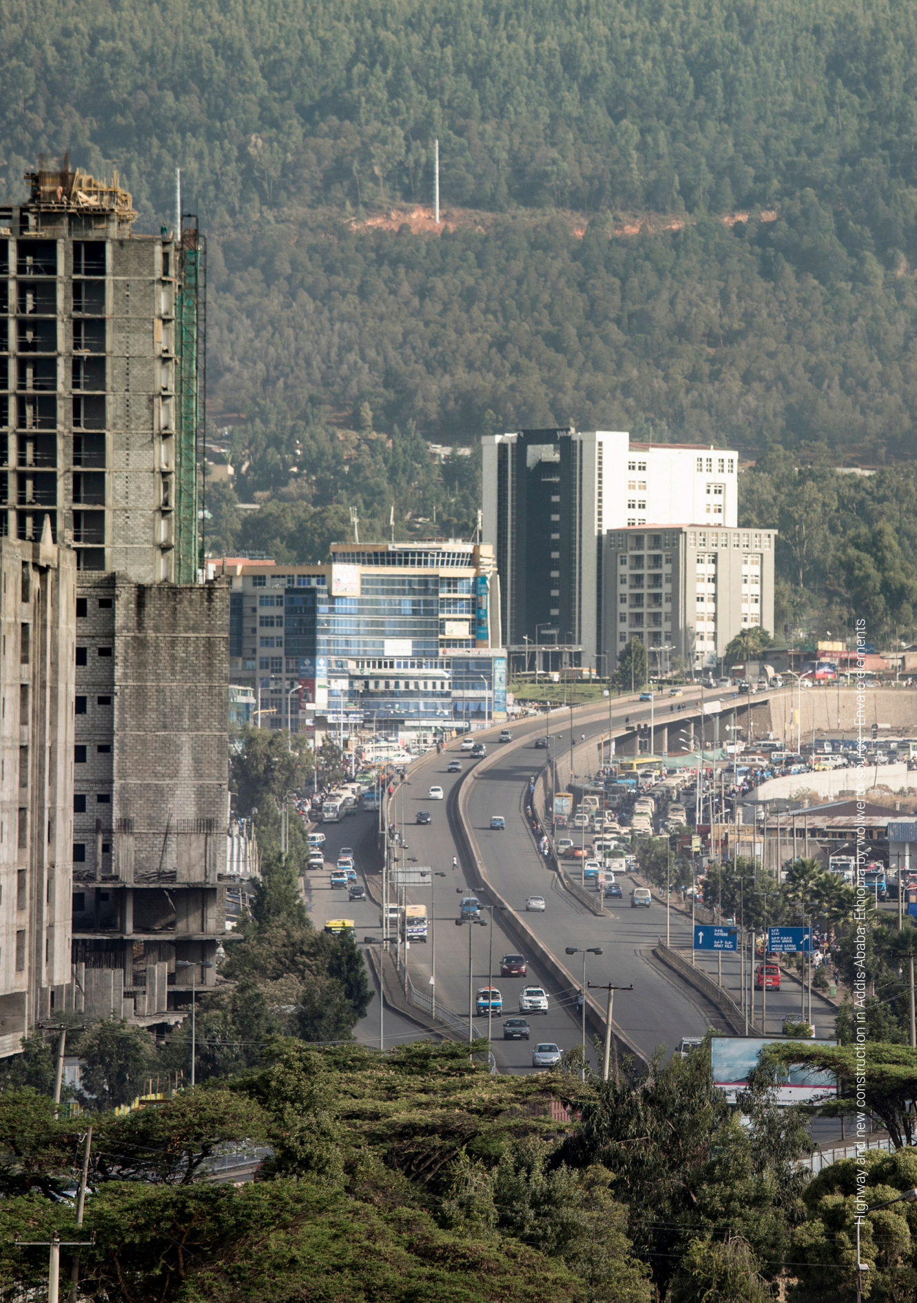
Highway and new construction in Addis Ababa, Ethiopia