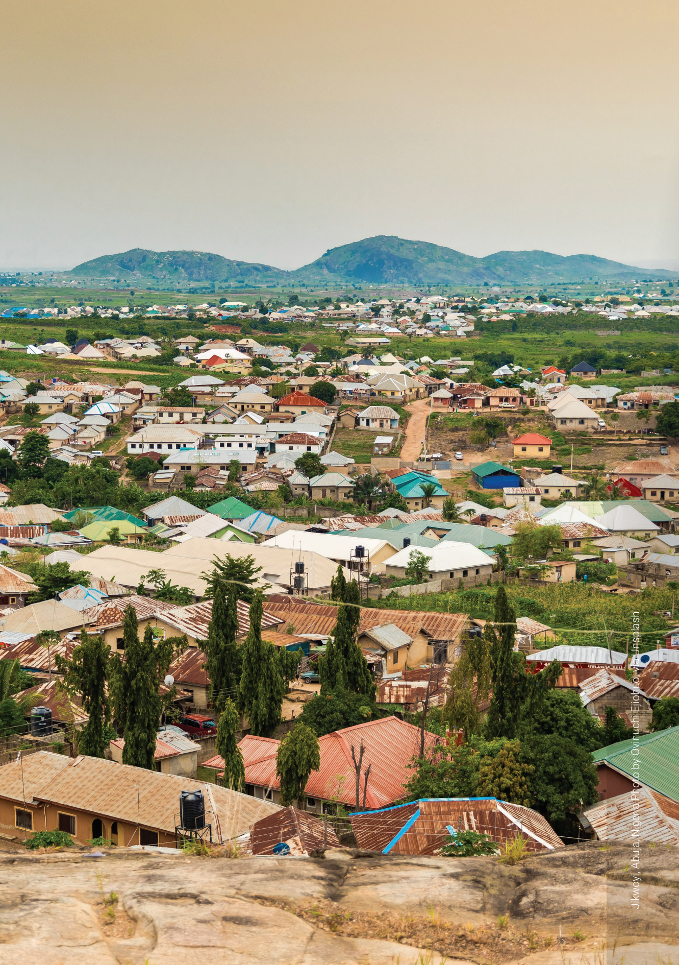
Jikwoyi, Abuja, Nigeria.