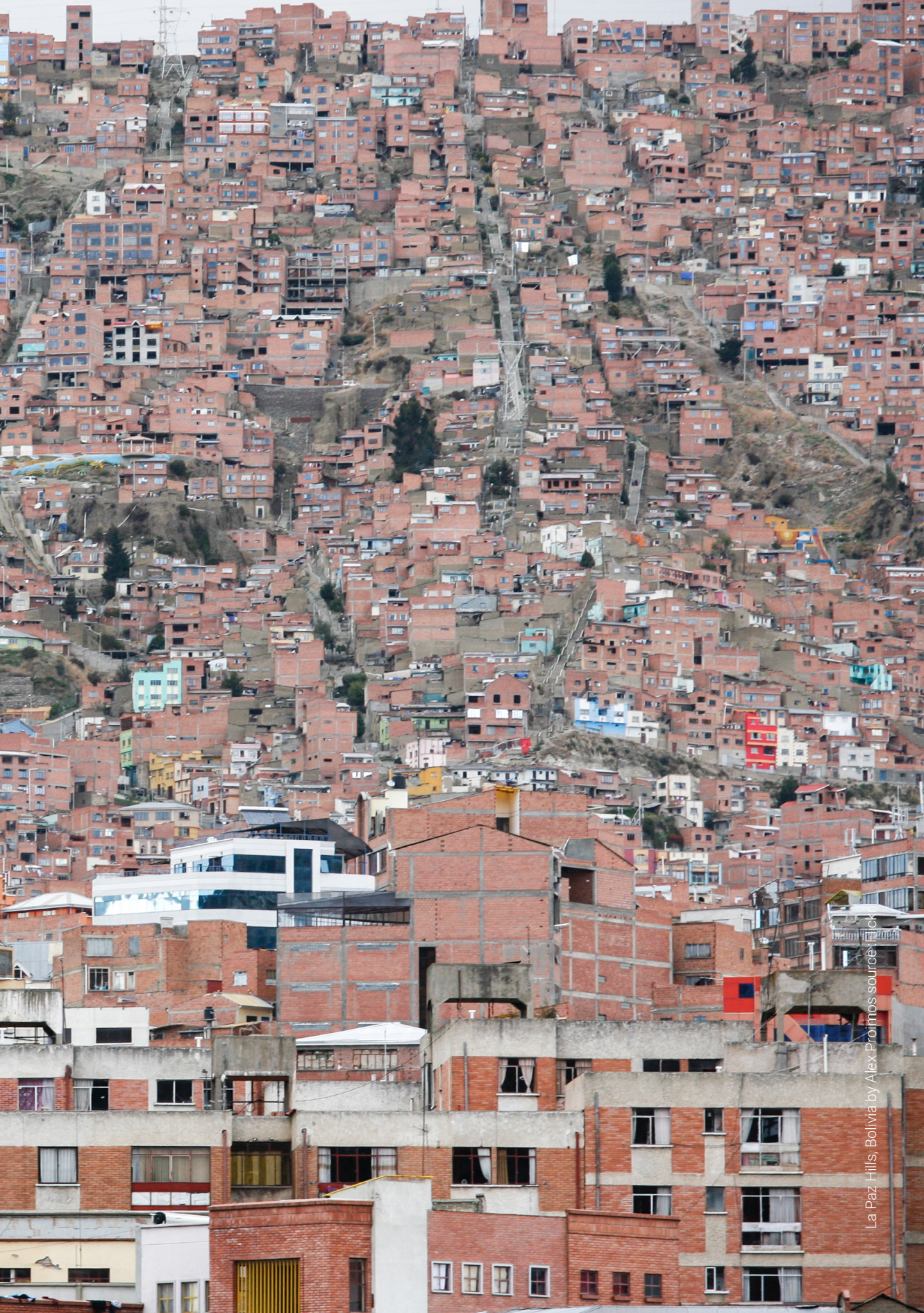
La Paz Hills, Bolivia