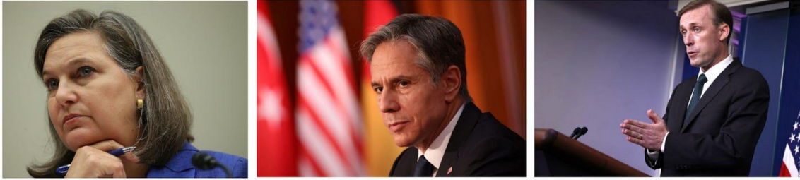
THE PLAYERS Left to right: Victoria Nuland, Anthony Blinken, and Jake Sullivan.

Over the next several meetings, the participants debated options for an attack. The Navy proposed using a newly commissioned submarine to assault the pipeline directly. The Air Force discussed dropping bombs with delayed fuses that could be set off remotely. The CIA argued that whatever was done, it would have to be covert. Everyone involved understood the stakes. “This is not kiddie stuff,” the source said. If the attack were traceable to the United States, “It’s an act of war.”