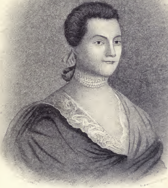
ABIGAIL ADAMS From an early portrait