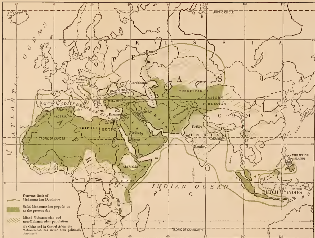
THE WORLD OF ISLAM.