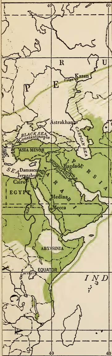
THE WORLD OF