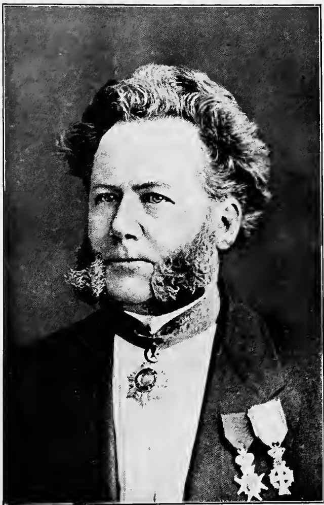
Ibsen in Dresden, October, 1873.