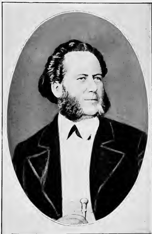
Ibsen in 1868.