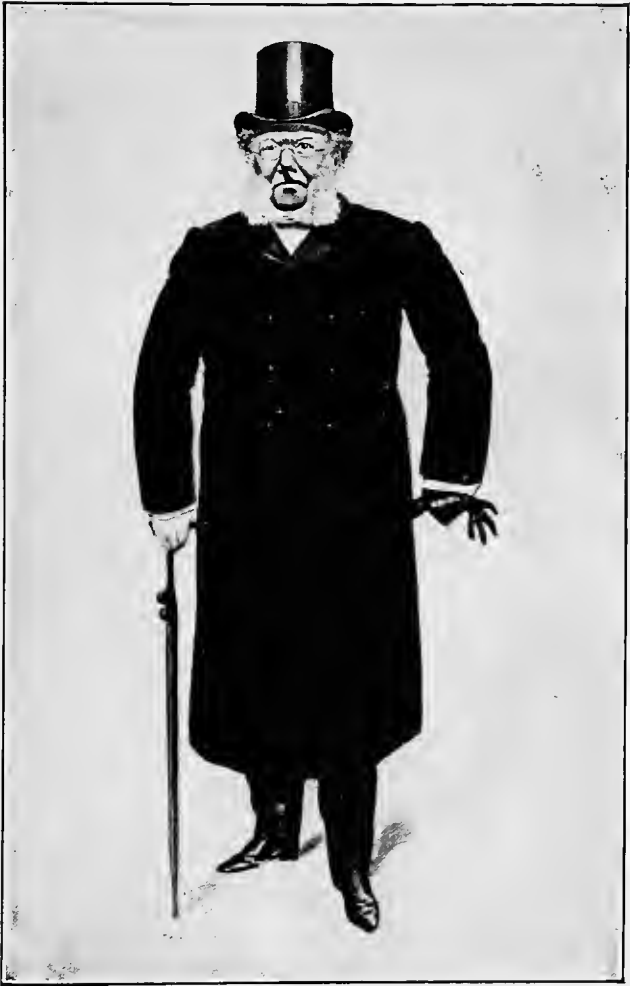
From a drawing by Gustav Laerum.