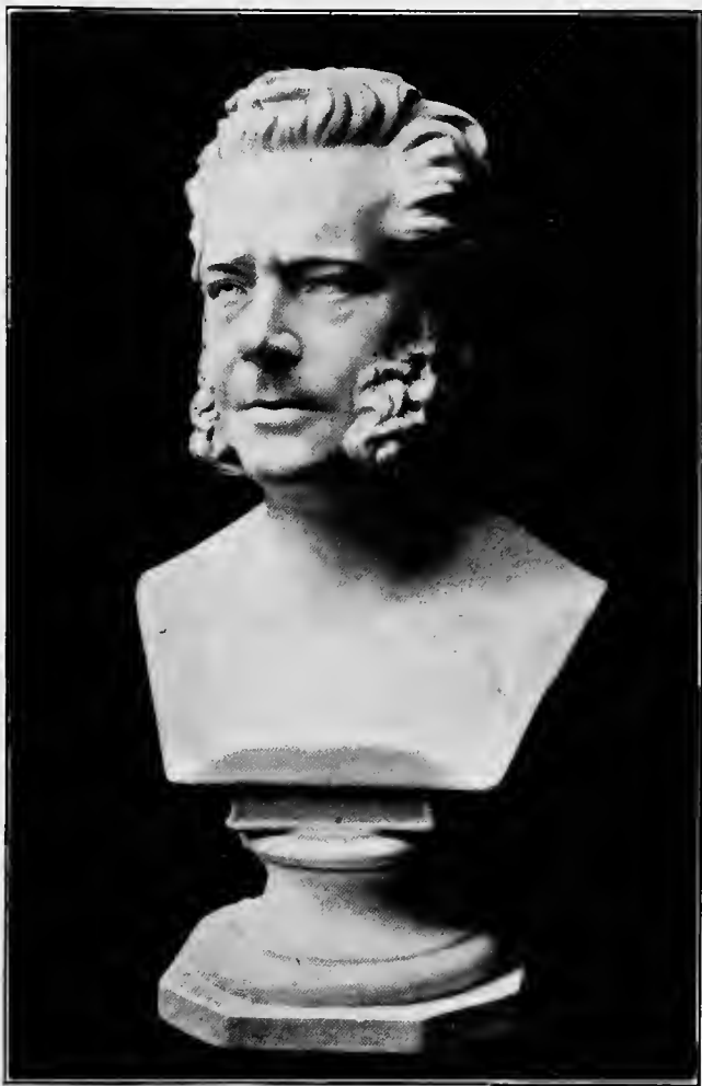
Bust of Ibsen, about 1865.