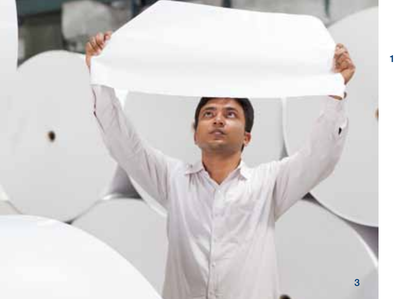
1-3 OnEfficiency Forming stabilizes and coordinates dewatering, retention and flocculation.