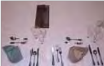
Table Setting (Note: The Mallet and Gavel above)

(1) All tables are set alike to accommodate right-handed people.