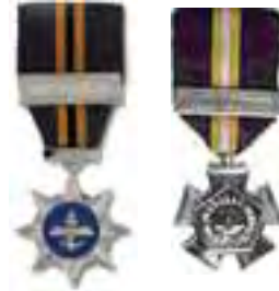
The SAF Overseas Medal

on completion of a further 10 years, and a second clasp on completion of a total of 30 years.