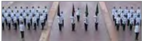
The Parade rendering a compliment to the Reviewing Officer

In the past days, the dress parades are intended to impress visiting emissaries with the strength of the monarch's troops rather than honour the visitor.