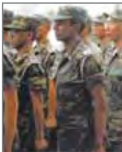
OCT wearing a lanyard

Lieutenant French lieu (place) tenant (holding). He is the officer who “holds the place of” another. By usage, it has come to mean the officer who holds the place of a captain.