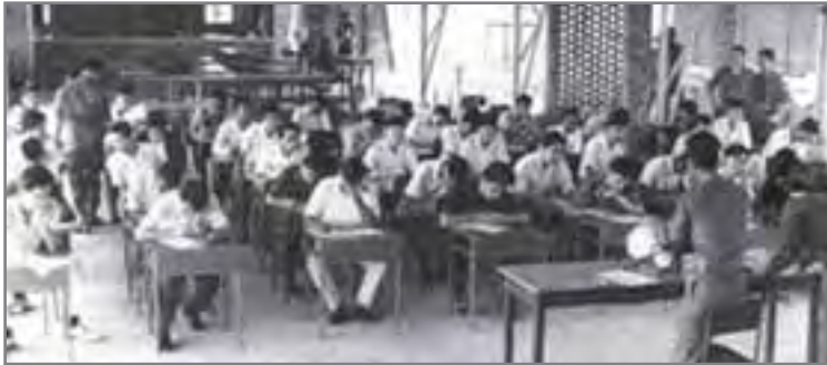
Applicants were required to sit for an IQ test

SAFTI MI was then known as the SAF Training Institute or SAFTI and was originally housed in Jurong Primary School. Immediately after Singapore gained independence, one of the most compelling tasks faced by our leaders was to build a credible armed forces. Hence, the primary aim of SAFTI was to train officers and non-commissioned officers (NCOs or Specialists as they are known today) to lead the then infant SAF.