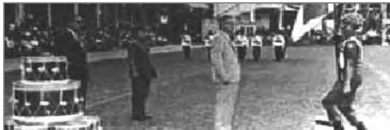
The presentation of Regimental Colours to 3 SIR by Mr. Lim Kim San (third from left).

The SAF Day is a reaffirmation of the importance of national defence and the vital role that every soldier plays in the security of Singapore.