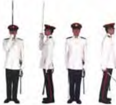
The Recovery The Sword Salute

The sword in earlier forms was in the shape of a cross, and the position of recovery closely resembles the Crusader's act of kissing the cross of his sword before going into battle.