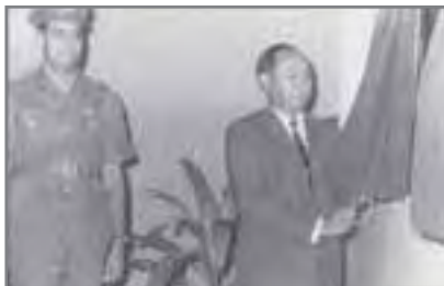
Dr. Goh Keng Swee at the official opening

The name 'SAFTI', so well known as the professional training ground of SAF leaders, was adopted for the Military Institute.