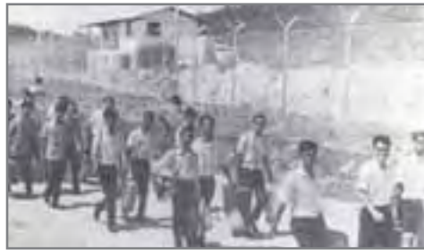
The arrival of the first batch of recruits on June 1, June 1966

SAFTI MI was then known as the SAF Training Institute or SAFTI and was originally housed in Jurong Primary School. Immediately after Singapore gained independence, one of the most compelling tasks faced by our leaders was to build a credible armed forces. Hence, the primary aim of SAFTI was to train officers and non-commissioned officers (NCOs or Specialists as they are known today) to lead the then infant SAF.