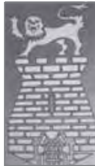
First 1 SIR logo inaugurated on 4 March 1957. The logo used was one of a lion standing on a tower. This first logo was reminiscent of British influence with its richness and grandeur.

The start of National Service led to many of 1 SIR's experienced commanders being called upon to train National Servicemen. In October 1968, 1 SIR joined the ranks of 3 and 4 SIR in training national servicemen and by the end of 1969, 1 SIR had become a fully operational national service battalion.