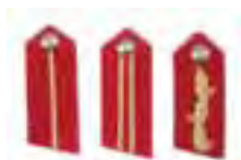
Col BG MG and above

Gorget patches are worn with the Number 1 dress uniform for Army officers above the rank of COL. They are fastened at the collar with the base at the forward edge of the collar and the pointed edge inwards. It can be described as a "coloured collar patch (usually red) with a button and either gold lace oak leaf motif or silk cord."