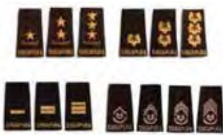
Epaulettes and shoulder straps

The ranks of Warrant Officers and Officers are inserted into these epaulettes.