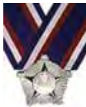
Darjah Utama Bakti Chemerlang (Tentera) The Distinguished Service Order (Mil)

This medal may be awarded to any member of the SAF who has distinguished himself/herself through meritorious service in military command or staff work. There are three grades: gold, silver and bronze.