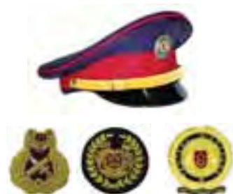
General Colonel LTC and below

The phrase cap badge is popularly used to describe a badge that is worn on a cap, a peaked cap or any other type of soft head-dress. Technically, however the badge worn on the beret is known as a beret badge. Badges had been worn on the garments of knights and lords of the Middle Age.