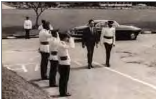
British “Open Palm” Salute

The history of saluting has many plausible origins. Some believe that during the “Age of Chivalry” when two knights met, they raised their visors to expose their faces. This allowed the knights to recognise their allies from their enemies. The raising of the visor was always performed with the right hand. During the “Middle Ages”, men wore heavy capes to conceal their swords. When two men greeted each other they