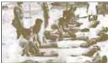
First intake of SAFTI recruits undergoing the fitness test.

Located on 88 hectares of land along Upper Jurong Road, the SAFTI Military Institute is arguably the most impressive if not the most imposing structure of all SAF buildings. From the red terracotta of the main buildings to the cascading terraces at the Cadet Dining Hall, SAFTI MI is a handsome complex indeed. Although its history is relatively short, compared to other more established and prestigious military institutes such as