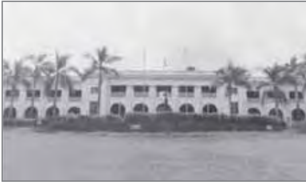
Tanglin Complex served as MINDEF's headquarters from 1972 to 1989

and Air Force, providing policy direction, managerial and technological support for the SAF.