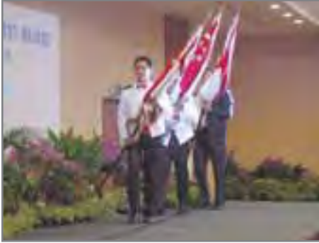
Marching in the Colours