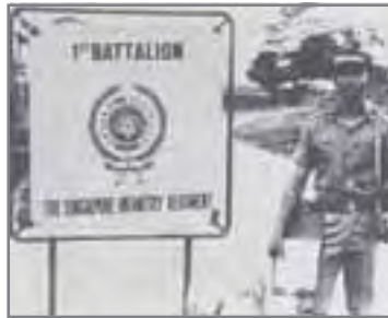
The second logo of 1SIR was instituted on March 11, 1961

With the announcement having been made of the British pulling out her forces from Singapore, it became imperative to accelerate our military build-up