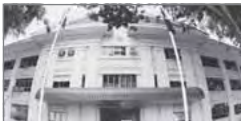
MID's home in Pearl's Hill

The build-up of the SAF was no easy task which was made worse by the lack of internal expertise and experience.