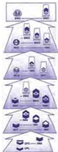
SAF Warrant Officer and Specialist Ranks – Old and New

These buttons are normally worn on the SAF Number 1 dress, Number 2 dress and the Number 5 jacket.