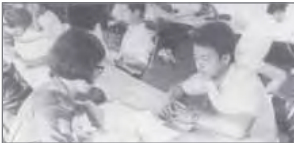
Singapore youths sign up for National Service at CMPB

“First and Foremost” has come a long way from being the motto of our pioneer battalion to become