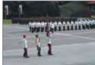
The Retirement of 6 SIR Colours on 1 Jul 2005 due to fair wear and tear

Colours should be serviceable for at least 15 to 20 years. However, regardless of their age where through normal wear and tear, they become unserviceable or condition of the Colours may cause embarrassment to the Unit or there is a change in the design / name of the Colours, then the Colours should be replaced.