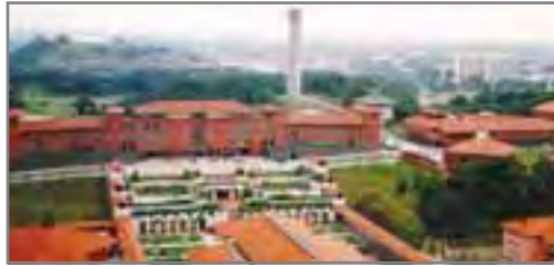
The New SAFTI MI

Sandhurst in England or USA’s Westpoint, SAFTI MI’s significance to the SAF is clear.