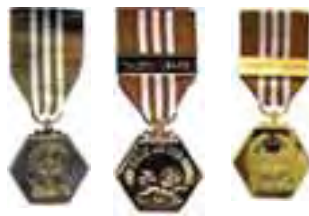
SAF Long Service and Good Conduct Medal

This medal may be awarded to a serving member of the SAF in recognition of 5 years of good, efficient and faithful service in the SAF.