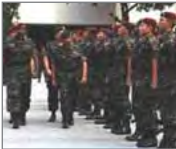
Sultan of Brunei inspecting the Welcome Guards