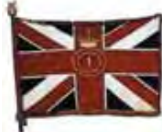
Queens' Colours, Singapore