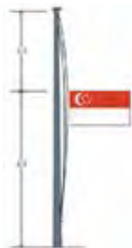
Flag at Half-Mast

When hoisting the flags at half-mast, the flags should be raised to the top of the pole before lowering to the half-mast position (one-third of the flag pole). In circumstances when a flag raising ceremony is done with the singing of the National Anthem, the Flags are hoisted to the peak of the pole in tune with the National Anthem, thereafter lowered to the half-mast