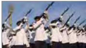
Fire of Joy

The Feu-de-Joie (French origin) symbolically portrays the sense of joy and festivity of the occasion.