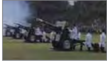
Gun Salutes provided by the Ceremonial 25-Pounders

Warships originally fired seven-gun salutes – the number seven probably selected because of its significance. Seven planets had been identified then and the phase of the moon changed every seven days.