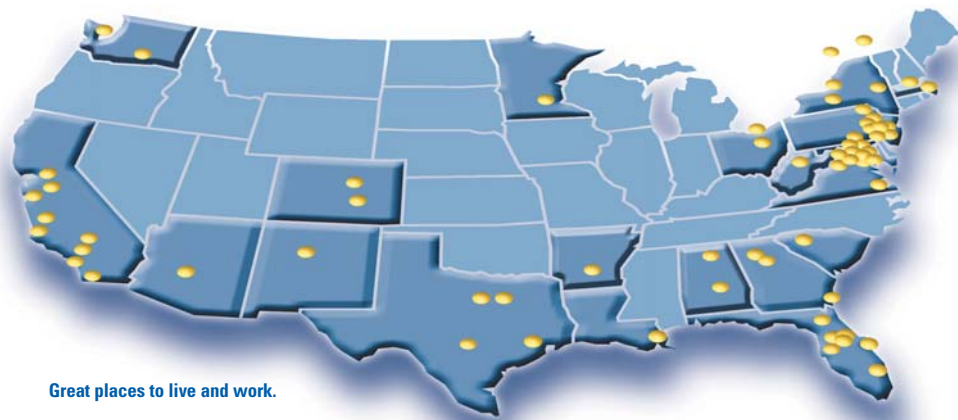
Great places to live and work.