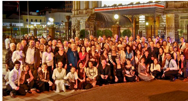
Closing Ceremony attendees outside Costa Rica's National Theater

Brasil de Mora: Hundreds attended the 4 th Global Alliance Summit for Ministries and Departments of Peace , which took place 17-22 September 2009, and was hosted by the Costa Rican Government and Rasur International. 100-200 people from 40 countries participated, and 800 attended the closing ceremony in San Jose with musical performances and speeches by civil society & government leaders, most notably the new Minister of Justice and peace. The Summit concluded with a determination to witness the formation of at least two more Ministries or Departments of Peace by the time of the next Summit, to be held in 2011. A full report of the Summit is available.