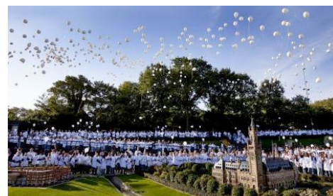
The Hague, Netherlands

We will utilize online and communication tools to foster and document these partnerships and connections. Let us build the awareness that Peace means being inclusive and supportive of all Peaceful cultures, ethnicities, faiths and backgrounds – even when we’re an ocean away. By doing so, we will build the foundation for a global community that is at Peace. Let’s help future generations see that we share one planet, and one sky.