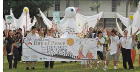
Singapore City, Singapore

It is the hope of the Culture of Peace Initiative that this 2009 Peace Day report will inspire connections to be fostered across all borders. Our mission has always been: to serve as a vehicle for bringing forward previously unseen and unheard voices working towards Peace, and to unite strengths of existing individuals and organizations building Cultures of Peace for succeeding generations.