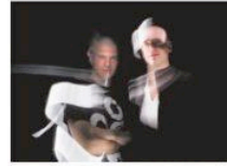
ENLIGHTENED: Boa Labo

In addition to a five-day run for Jeremy Gilley’s doc The Day After