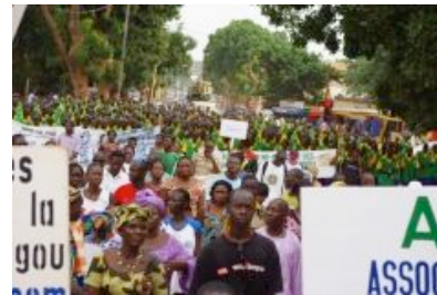
Ouagadougou, Burkina Faso

For 2010, the Culture of Peace Initiative is issuing a call to action. To support the goal of a more interconnected world, we invite you to begin taking the first steps towards forming a mutually supportive relationship with another Peace Day organization or community! Say “hello” to a neighbor or a group halfway around the world!