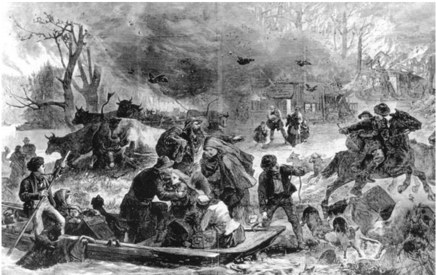
Peshtigo fire as depicted in Harper's Weekly, 1871.

State politics revolved around factions headed by James Doty and Henry Dodge. As political parties developed, the Democrats proved dominant throughout the period.