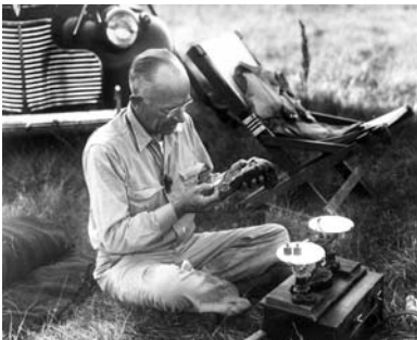
Aldo Leopold (1887-1948) personified Wisconsin's conservation ethic.