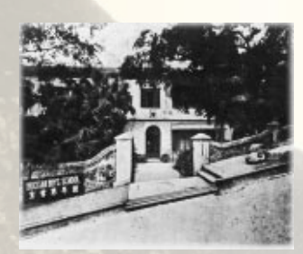
東邊街入口 Entrance at Eastern Street

拔萃書室當時為寄宿學校,招收不同國籍學生。該校開設有關西方知識新學科,曾培養出不少為香港及內地服務之畢業生。該校於1926年遷往九龍。原址於1941年改建為羅富國師範學校。1962至1971年間,又用作香港中文大學聯合書院校舍。現址為般咸道官立小學。