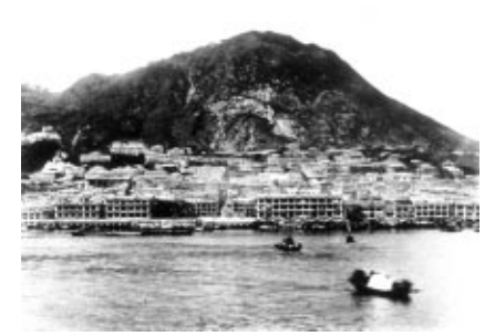
從維多利亞港眺望中西區,十九世紀末。 View of the Central and Western District from Victoria Harbour, late 19th century.

孫中山先生多年間在港的活動, 都集中在港島中區及西區,現在中西 區區議會為紀念孫中山先生誕辰一百 四十週年,為「孫中山史蹟徑」修訂 指示牌及重編小冊子,介紹其在區內 的有關史蹟,實非常恰當。