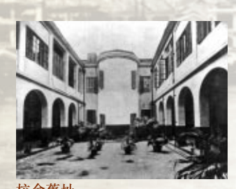
校告告述 The old school premises

The Diocesan Home and Orphanage was then a boarding school for children of different nationalities. It provided subjects of modern Western learning and had turned out many graduates for service in Hong Kong and Mainland China. The School was moved to Kowloon in 1926. On the old site at Eastern Street was built in 1941 the Northcote Teachers' Training College. Between 1962 and 1971, the site was used as