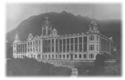
成立於 1911 年的香港大學 The University of Hong Kong founded in 1911

歷史性聚會,港大在校園中心的荷花 池旁,豎立了孫中山紀念銅像,象徵 港大對這歷史偉人的敬意。當時演講 場地「大禮堂」(現稱陸佑堂) 所在的 本部大樓,已成為港大的文化遺產, 在1983年成為法定古蹟。