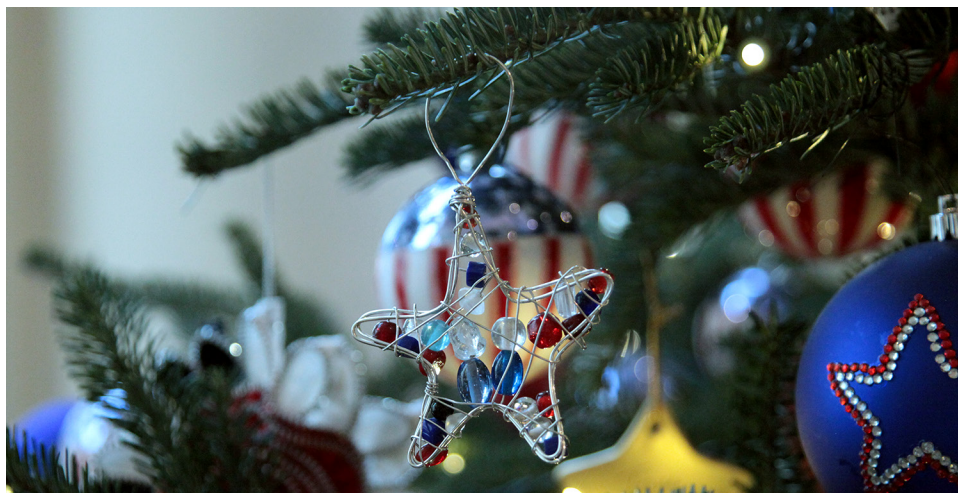
A beaded star ornament in the East Landing Room of the White House, December, 2012.

The trees in the East Landing Room are decorated with a variety of handmade beaded stars of red, white, and blue. You can make these yourself with supplies you can find at any craft store.