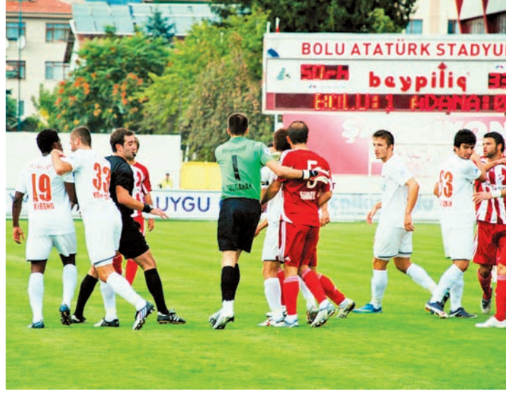
The rough and tumble Boluspor-Adanaspor match produced four red cards.