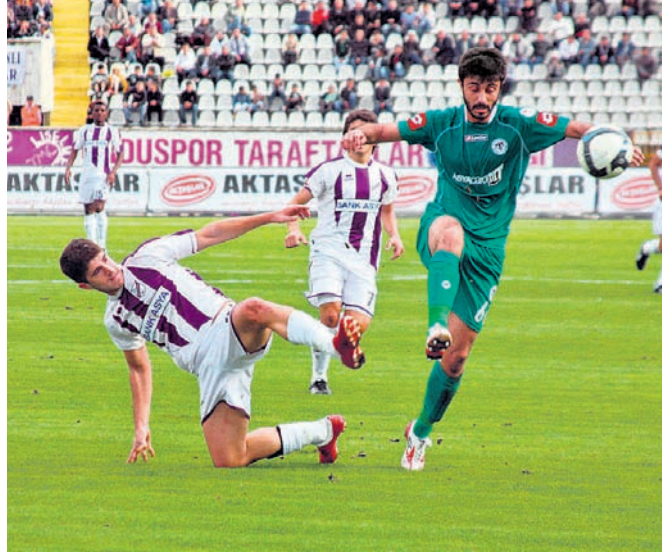
A scene from the Orduspor-Konyaspor Bank Asya League 1 match.