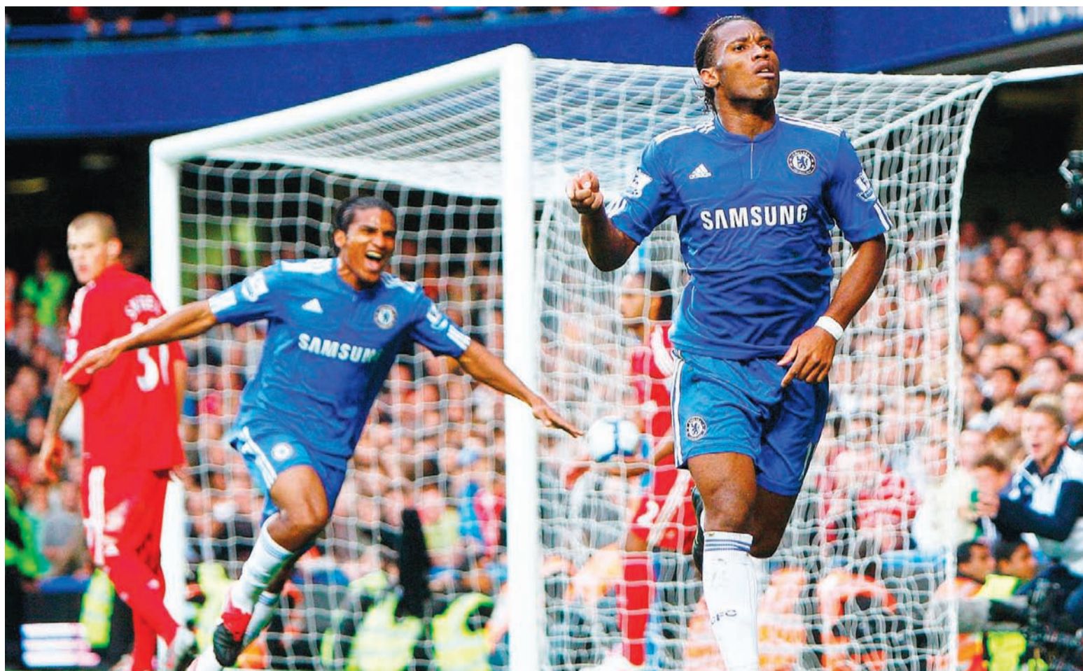
Chelsea's Florent Malouda (2nd L) celebrates his goal against Liverpool with Didier Drogba (R) during their English Premier League match at Stamford Bridge in London.

Champion Porto stayed in touch with surprise leader Braga after a 3-0 win at Olhanense on Sunday. Colombia striker Radamel Falcao Garcia continued his impressive start at Porto by scoring the first and third goals, with Bruno Alves adding the other. Braga maintained its 100 percent record with a 2-0 home victory over Vitoria de