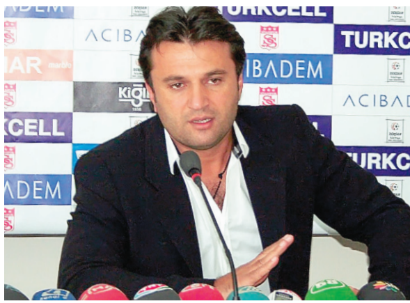
Bülent Uygun announcing his resignation in Sivas on Sunday.

As he told Sunday's Zaman last June, "I took the good