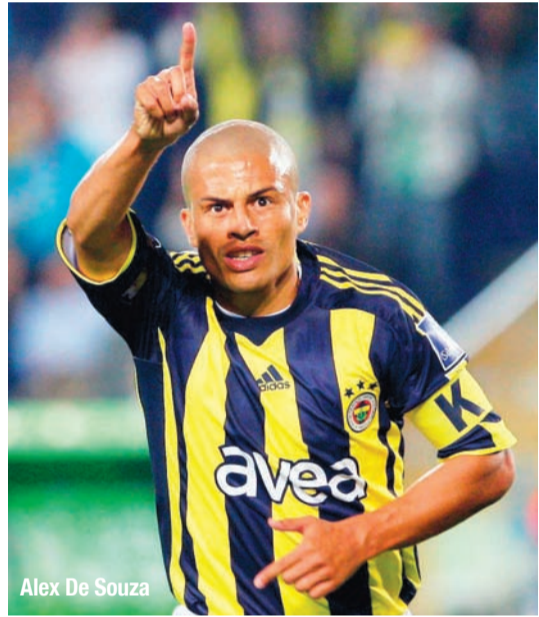
Alex De Souza

02 Chelsea returns to the top of English Premier League and Barca moves clear in Spain