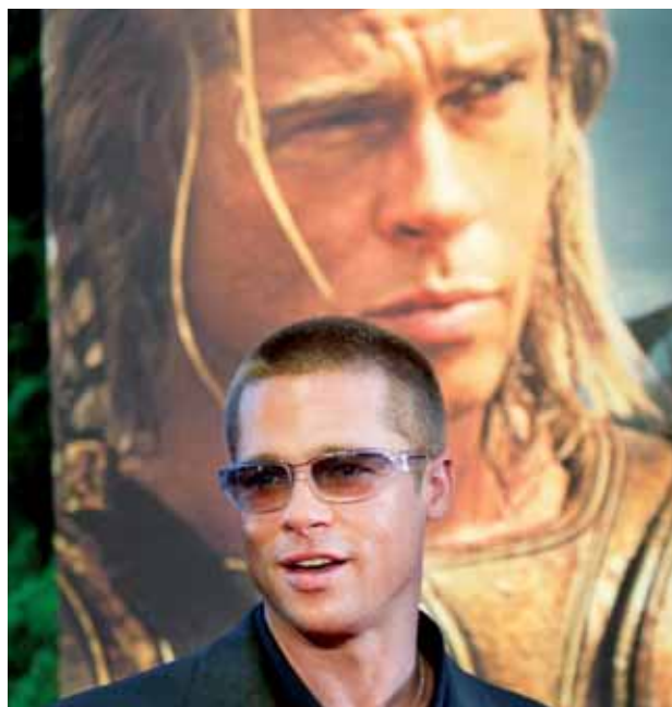
Brad Pitt walks past a poster of himself as the warrior Achilles in his latest film "Troy."