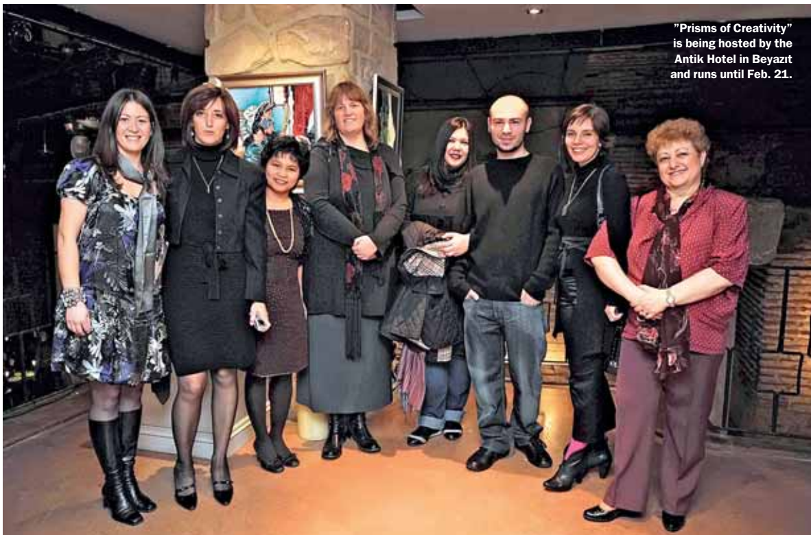
"Prisms of Creativity" is being hosted by the Antik Hotel in Beyazit and runs until Feb. 21.

Horizons Art Gallery Saray Sitesi No. 6 Papaz Çeşme Sokak Cami Mah., Tuzla, İstanbul Telephone: 216-446-4074