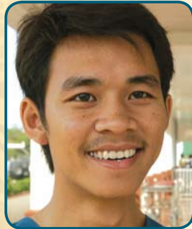
Eighty-three point six percent of financial gifts to the C&MA directly supports workers and their ministries. This compares favorably with other missions and ministries.