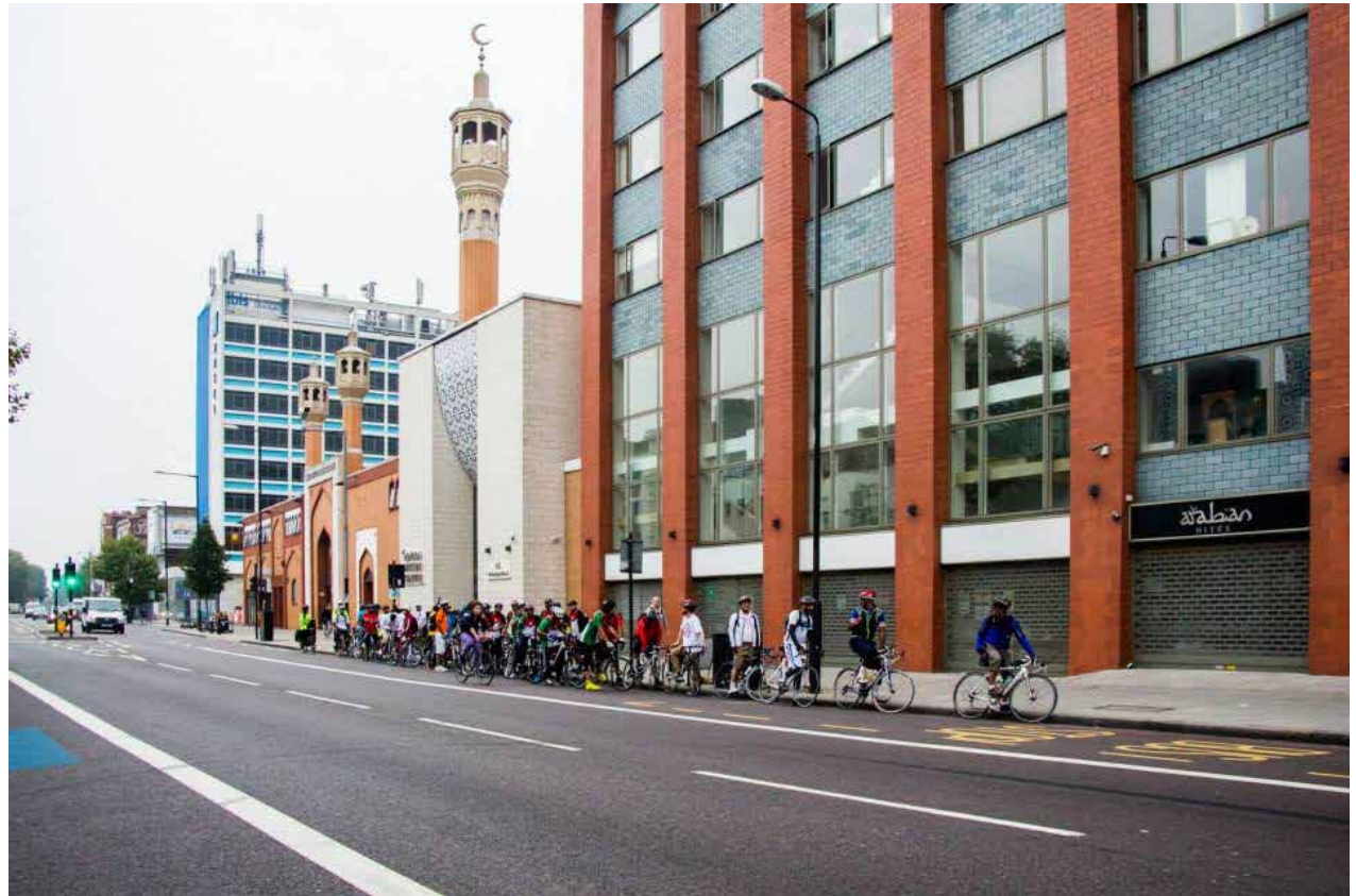
Muslim cyclists take part in 'Tour De Salah' a 100km endurance cycle organised by Made in Europe, which started from the London Muslim Centre after Fajr salah.

The North African Community Association (NACA) continues to provide services and facilities, not solely for the North African community, but the Muslim community as a whole. Its Al-Qalam Weekend Madrasah caters for children aged 5 to 17. Weekly youth circles aim to improve understanding of the correct manners and etiquettes of a Muslim. Muslim youth are taught to respect and value others and to contribute towards the community and society as a whole. NACA held seminars and talks on parenting and health advice.