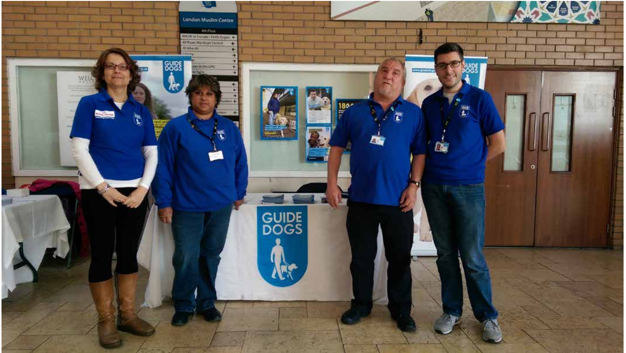
Guide Dogs charity team visits the London Muslim Centre to raise awareness about guide dogs and how they help the blind, including some Muslims.