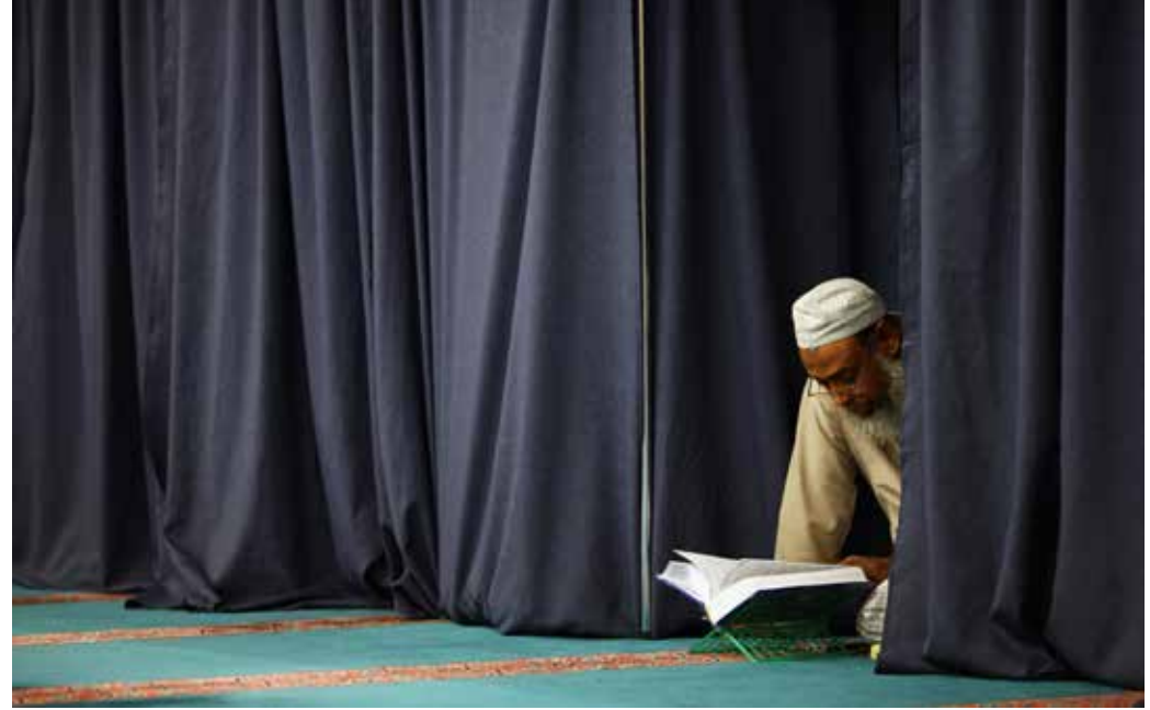
A worshipper in Itikaf recites from the Qur'an in ten days of spiritual seclusion.