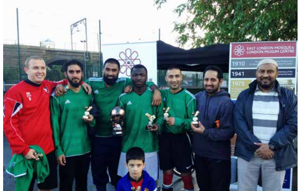
The winning team from the ELM Football Tournament 2013.