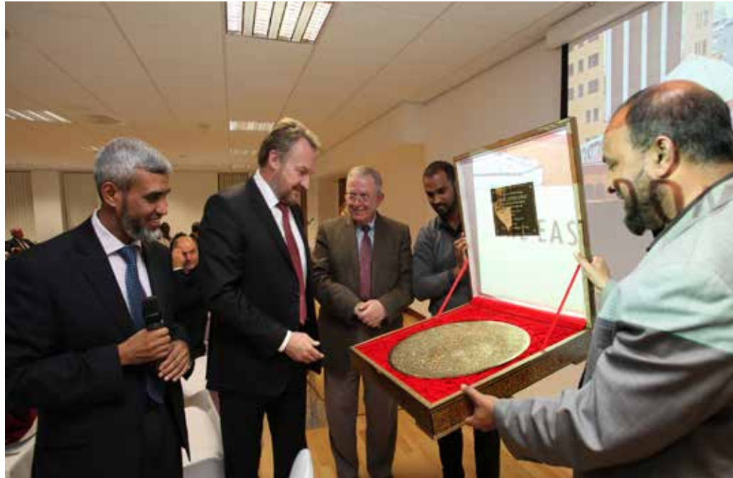
The President of Bosnia-Herzegovina is presented with a gift during his visit.