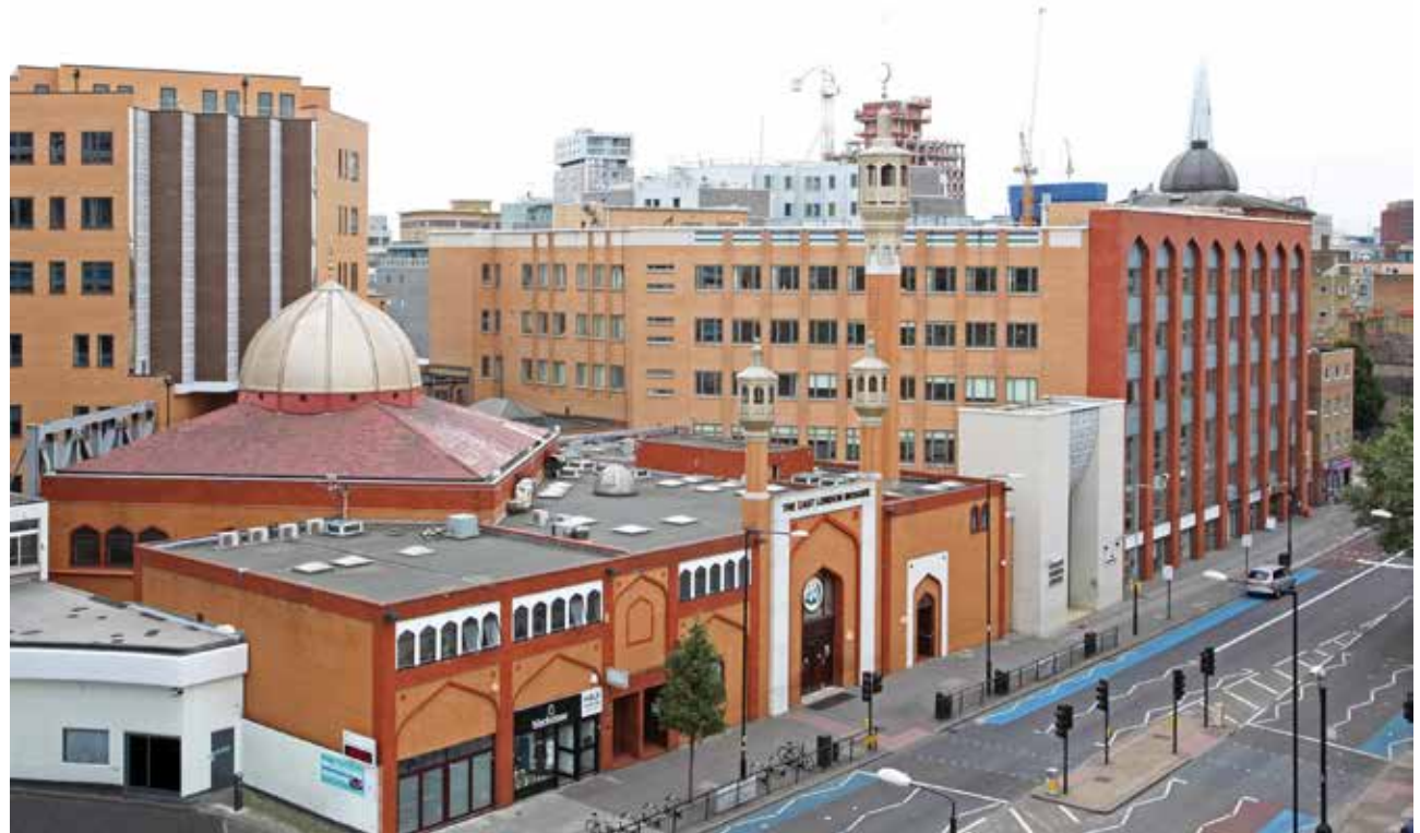
An exterior photograph of the East London Mosque, London Muslim Centre and Maryam Centre.