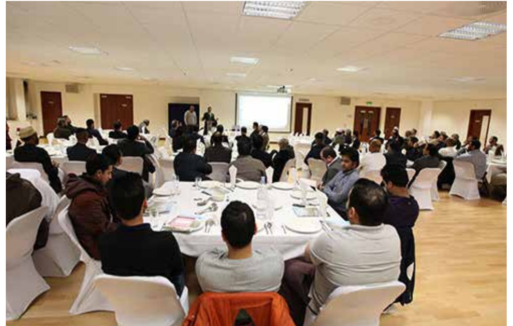
A group of local business leaders celebrate the Mosque's successes.