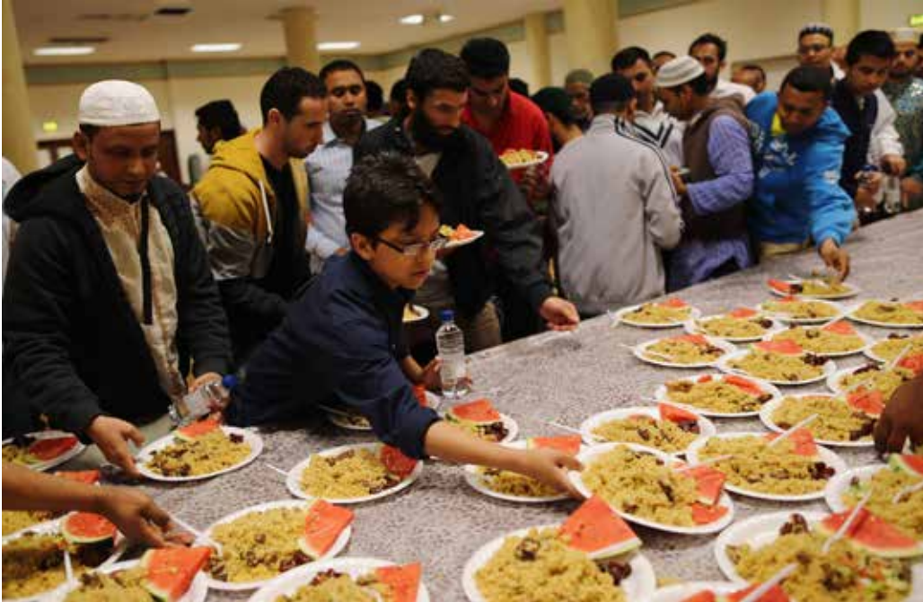
Ifar is served to over 500 people during Ramadan 2013 at the LMC.