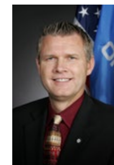
SEN. GARY STANISLAWSKI SD 35 - TULSA