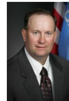
SEN. EDDIE FIELDS SD 10 – WYNONA