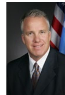
REP. GLEN MULREADY HD 68 – TULSA