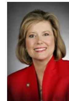
REP. PAM PETERSON HD 67 – TULSA