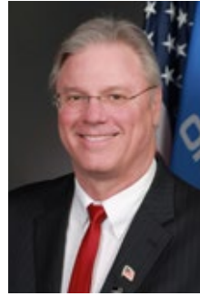
REP. MARK LEPAK HD 9 2015 RIED Score - 100