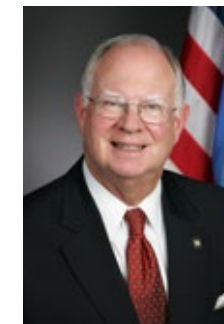
SEN. JOHN FORD SD 29 – BARTLESVILLE