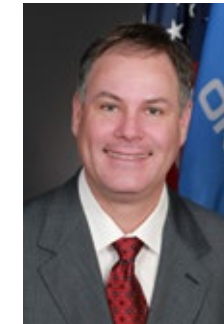
REP. JAMES LEEWRIGHT HD 29 - BRISTOW