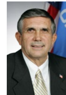
SEN. RON JUSTICE SD 23 – CHICKASHA