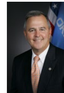
SEN. BRIAN BINGMAN SD 12 – SAPULPA