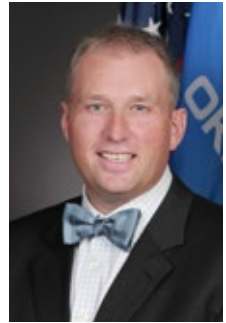
REP. CHAD CALDWELL HD 40 2015 RIED Score - 96