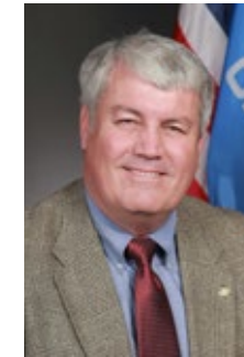
REP. JEFF COODY HD 63 – GRANDFIELD