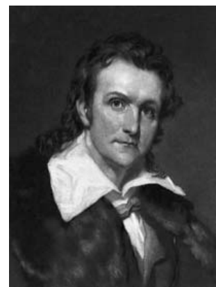
John James Audubon, elected 1830.

Career description: Writer (novelist, short story writer); Lawyer