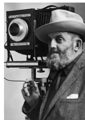
Ansel Easton Adams, elected 1966.