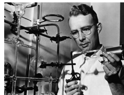
Luis Walter Alvarez, elected 1958.