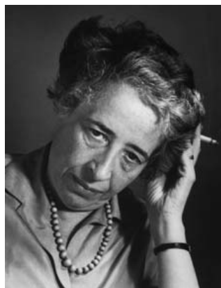
Hannah Arendt, elected 1962.

Career description: Lawyer; Educator; Government official