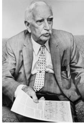
Charles Greeley Abbot, elected 1921.

Career description: Meteorologist; Astronomer; Government research agency staff member