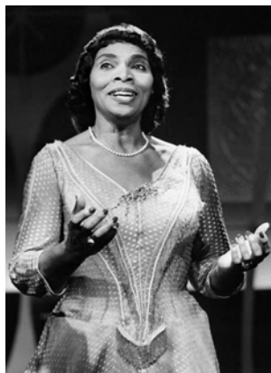
Marian Elina-Blanche Anderson, elected 1957.