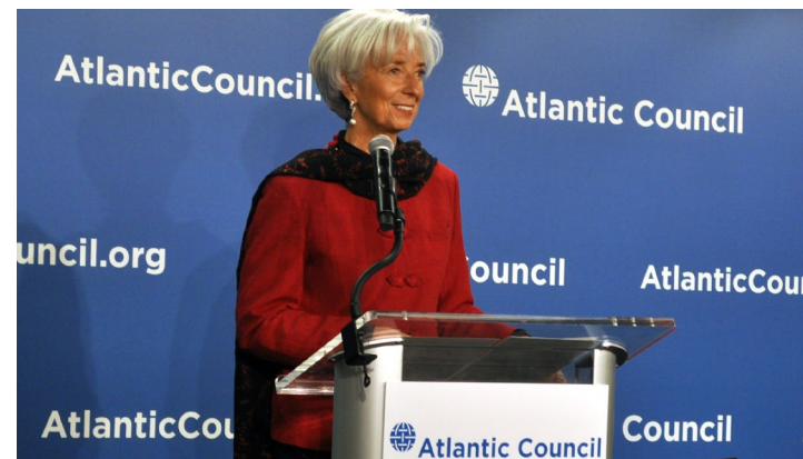
Madame Christine Lagarde, Managing Director of the International Monetary Fund speaking at the Atlantic Council.

As you can see, your choices are many. And no matter which planned gift you choose, you get peace of mind knowing that your careful planning makes a big difference in the lives of those we serve.