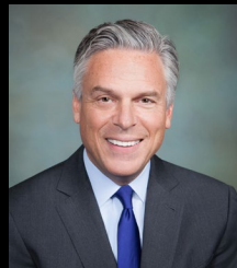
Jon M. Huntsman, Jr.

“As Chairman of the Atlantic Council, I am inspired by the bipartisan spirit with which the organization tackles global challenges, through innovative programming in its ten programs and centers and forward-looking analyses from its wide range of experts.