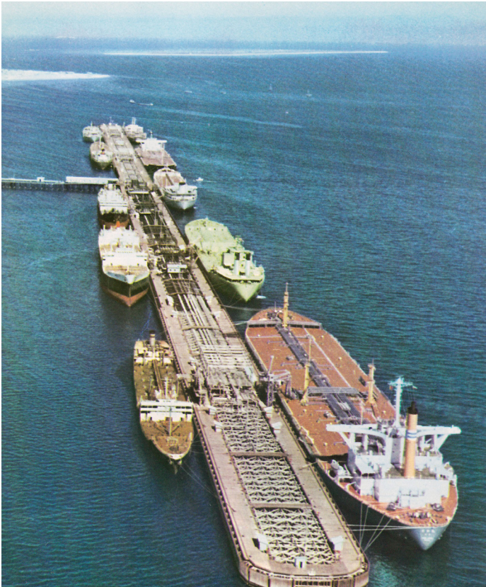
Large tankers loading at Kharg oil terminal, which handles significant quantity of Iran's crude exports.

to China belonged to the NITC. 28 Interestingly, Iran recently underwent a gap of not delivering oil to China for eighteen days, the longest in three years. Though it