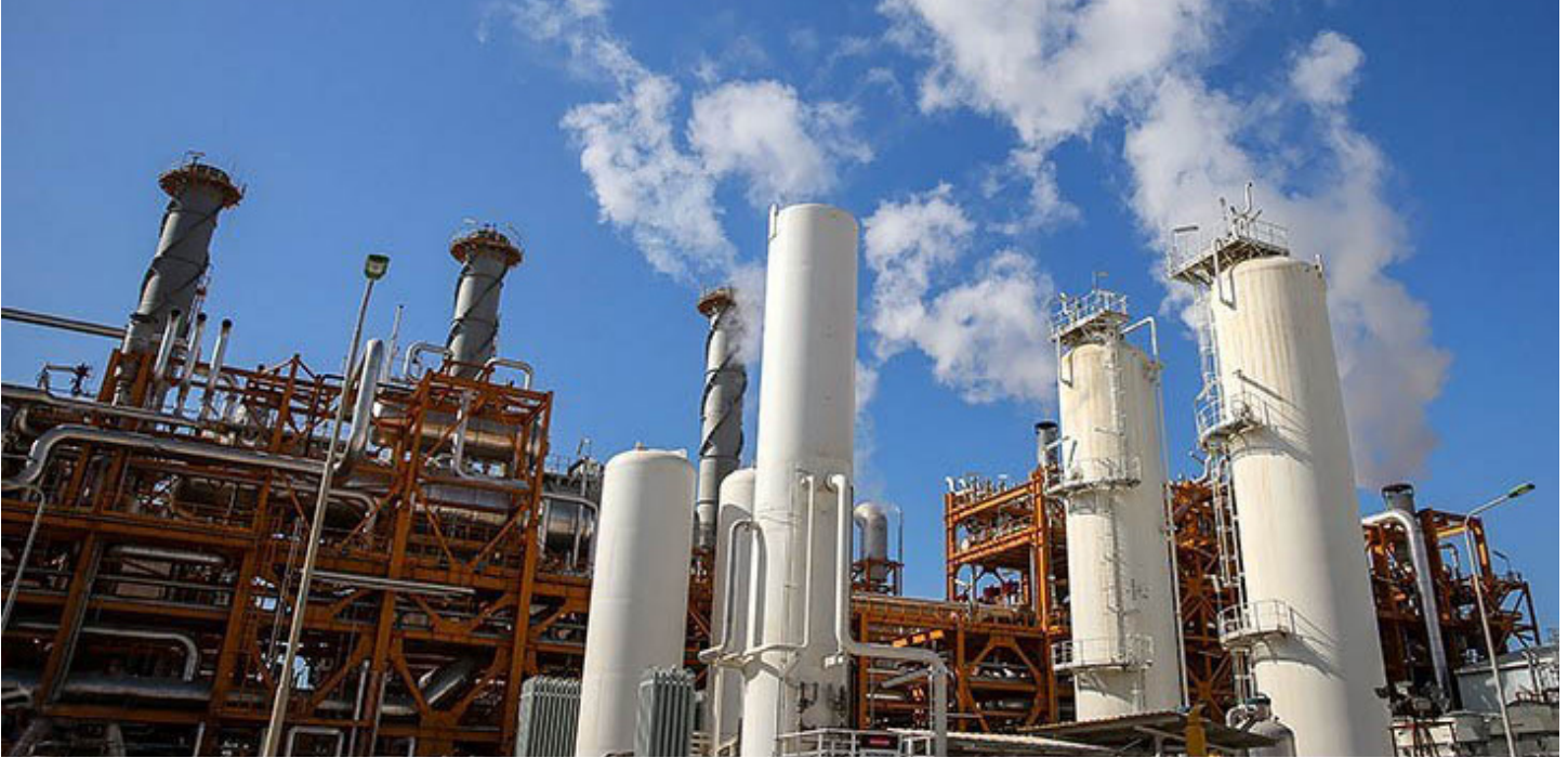
South Pars Onshore Facilities near Asaluyeh City, December 11, 2013.