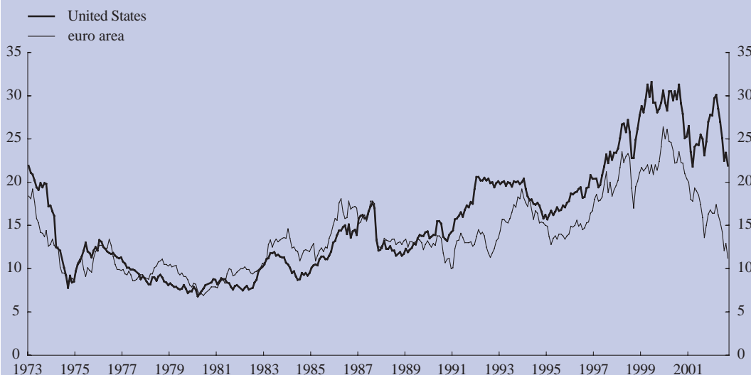
Chart B: Price/earnings ratios for the euro area and the United States