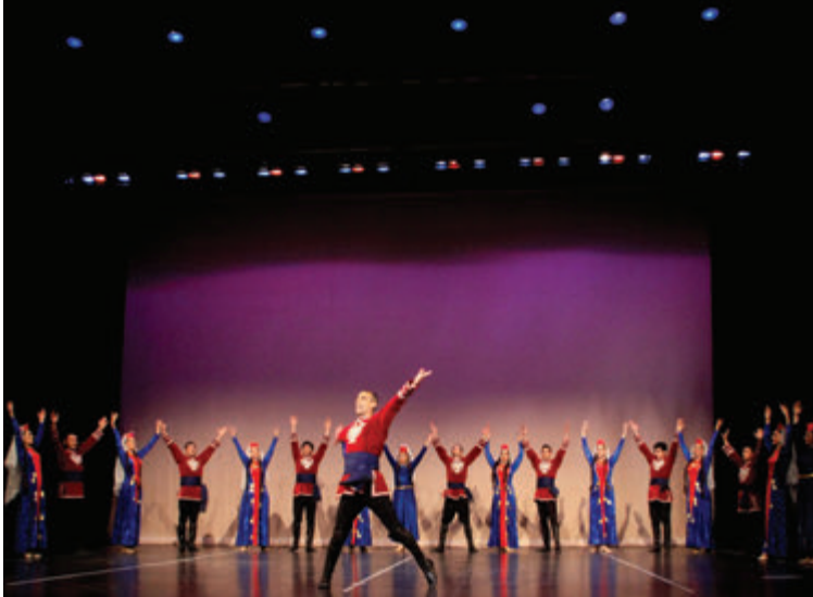
• The renowned “Sipan” dance group (2015).