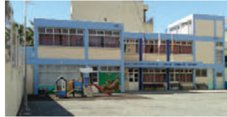
● Larnaka's Nareg Armenian School. It shares its yard with the adjoining church of Saint Stephen (2013).