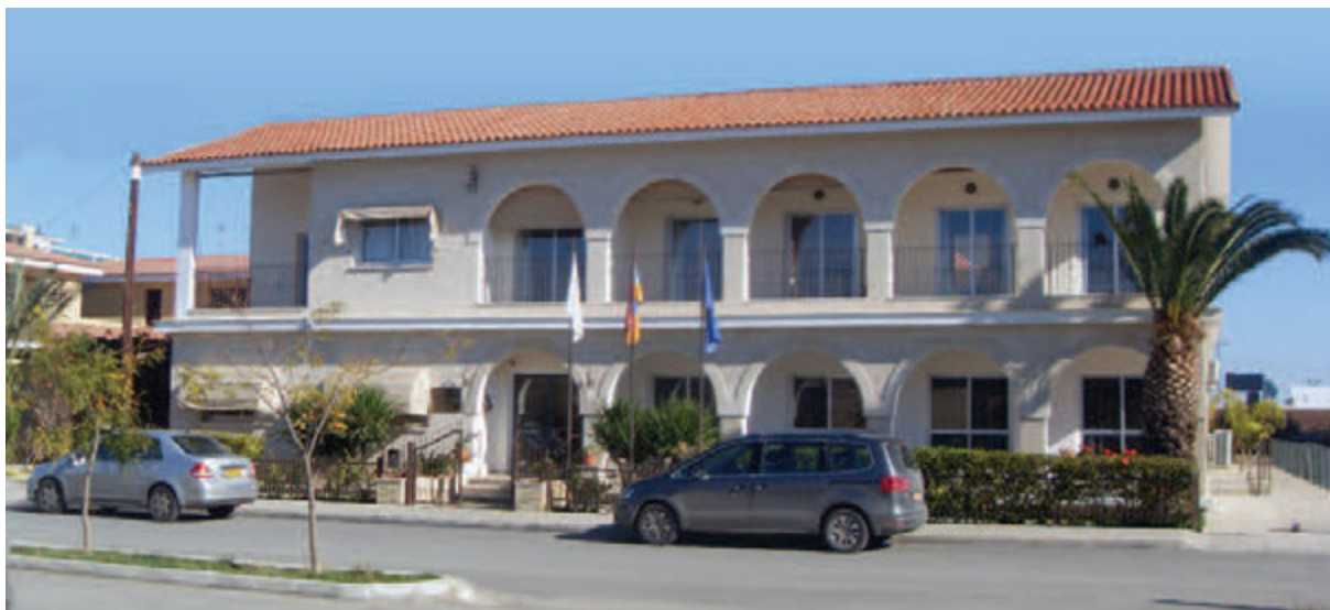
● The Kalaydjian Rest Home for the Elderly (2012).