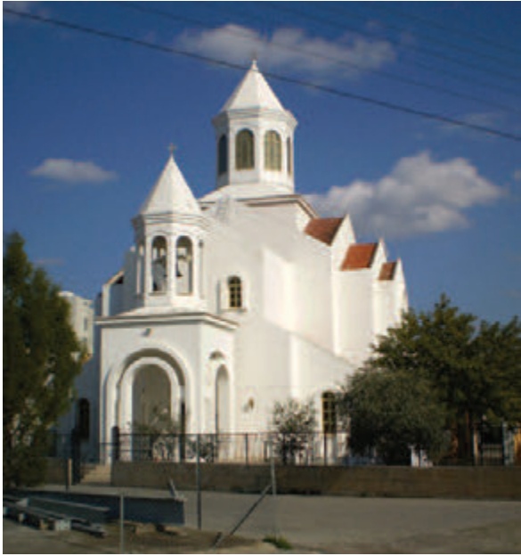
● The Virgin Mary cathedral in Nicosia (2012).