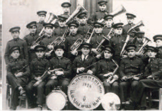
● The famous Melikian School Band (1930), founded by renowned musician Vahan Bedelian in 1926. The exiled King of Arabia, Hussein bin Ali, donated new musical instruments to it in 1927.