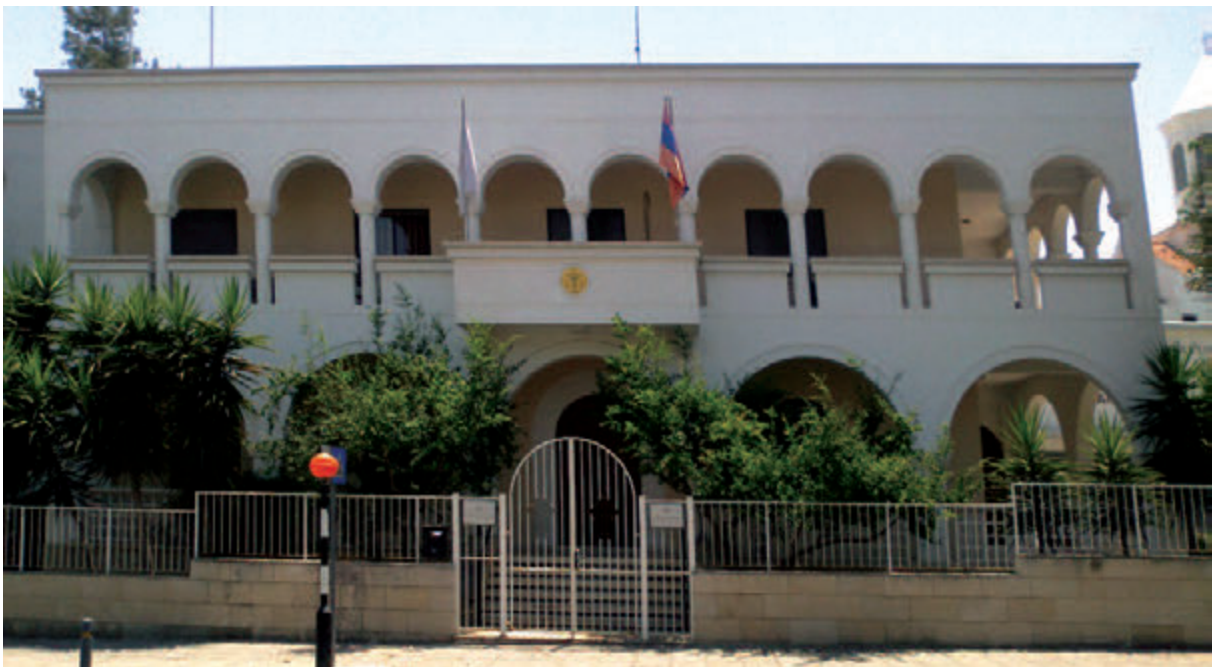
● The Armenian Prelature (2013).

The Prelature's Charter consists of 79 articles and, in its present form, applies as of 2010. Administration is exercised by the Armenian Ethnarchy (Azkayin Ishkhanoutiun) through the Diocesan Council (Yerespokhanagan Joghov) and the Administrative Council (Azkayin Varchoutiun). There are also local parish committees and ladies' committees (Nicosia, Larnaka, Limassol). The Prelature receives an annual grant from the government.