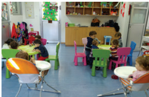
● Lesson at the "Nanor" Armenian Childcare Centre (2015)