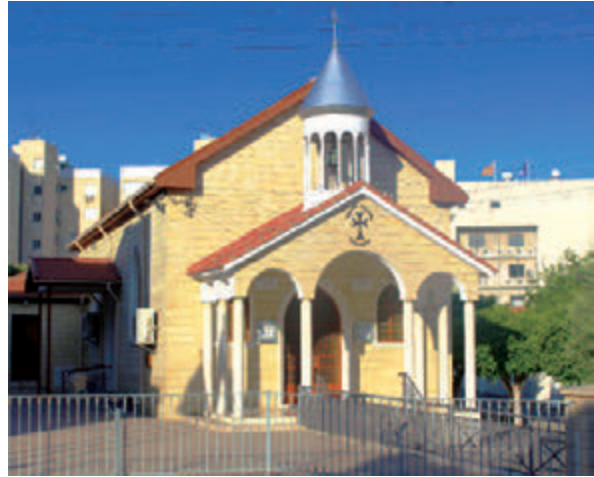
● Saint George's church in Limassol (2016).