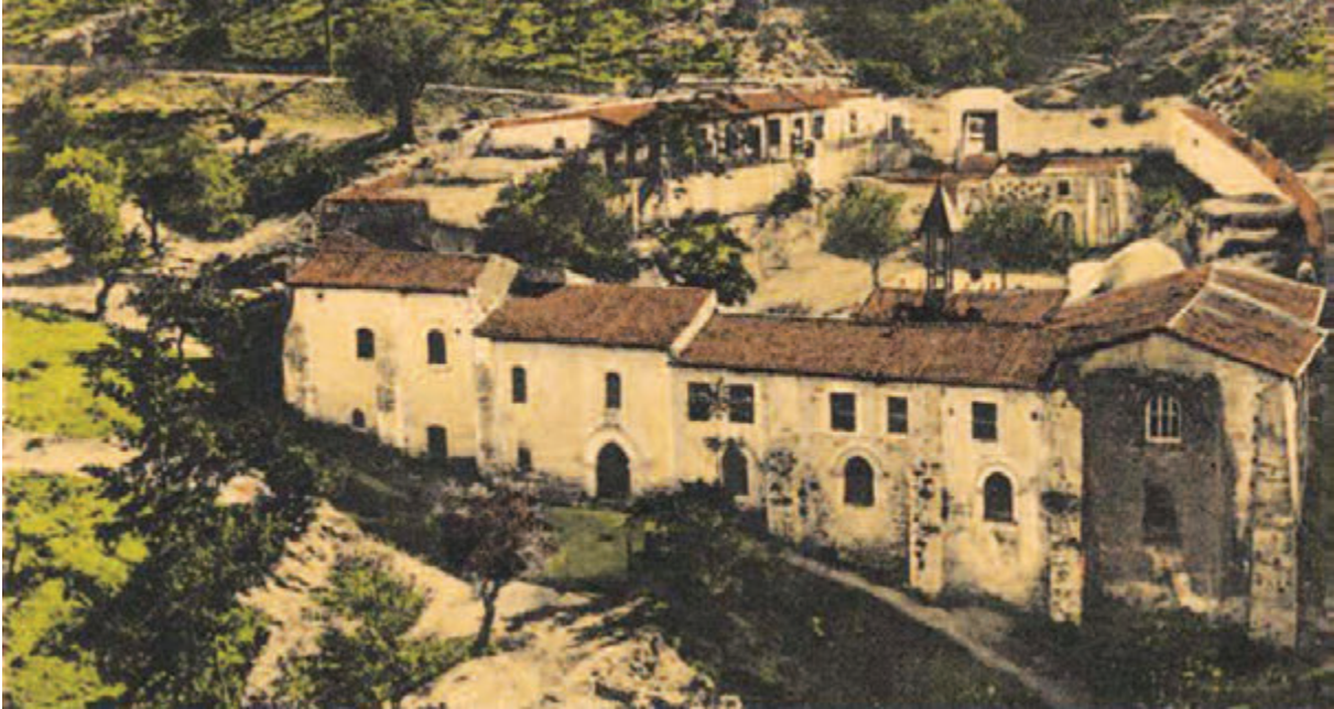
● Post-card showing the renowned Sourp Magar or Magavarank Monastery (1926).

Latin Era: After the purchase of Cyprus by the titular Frankish King of Jerusalem Guy de Lusignan in 1192, a massive immigration of Armenian and other bourgeois, noblemen, knights and warriors from Western Europe, Cilicia and the Levant took place, to whom fiefs, manors and privileges were bounteously granted. Because of their proximity, their commercial ties and a series of marriages, the Kingdoms of Cyprus and Cilicia became inextricably linked. In the subsequent centuries, thousands of Cilician Armenians sought refuge in Cyprus fleeing the Muslim hordes and attacks. Because of the continuous decline of Lesser Armenia, its last King, Levon V, fled to Cyprus in 1375. After his death in Paris in 1393, his title and privileges were transferred to his cousin, King James I de Lusignan, in the Saint Sophia cathedral in 1396; subsequently, the royal crest also bore the lion of Armenia.