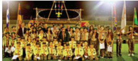
• The 77th Cyprus Scout Group of Cyprus (Homenetmen-AYMA: 2015).