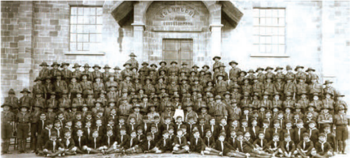
● Group photo of the first scouts of the Melkonian Educational Institute (1932).