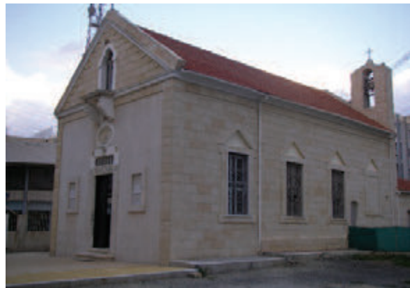
● Saint Stephen's church in Larnaka (2009).

Law-abiding by nature, Armenian-Cypriots always had a high profile with the British administration and many became conscientious civil servants and disciplined policemen or were employed at the Cyprus Government Railway and Cable and Wireless. Throughout the 1920s-1950s, many worked at the asbestos mines at Amiandos and the copper mines at Mavrovouni and Skouriotissa, some of whom had been trade unionists. Some Armenian