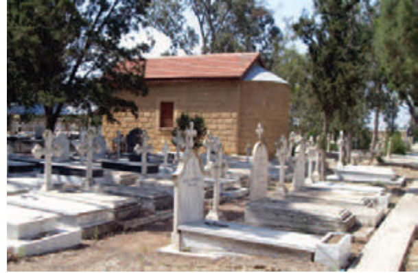
● The Holy Resurrection chapel at the Ayios Dhometios cemetery (2010).