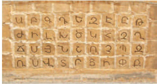
• The monument for the Armenian Alphabet at the Melkonian Institute.