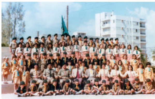
● The 4th Cyprus Boy Scouts' Group of the Nicosia Nareg School (1976).