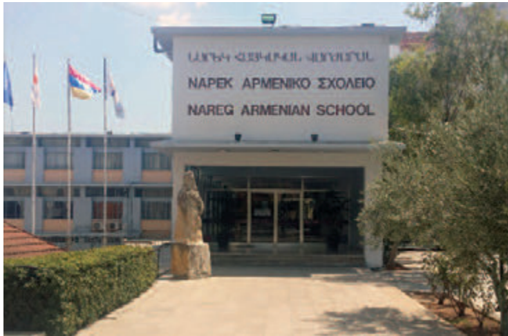
● Nicosia's Nareg Armenian School. It shares its yard with the adjoining cathedral of the Virgin Mary (2016).