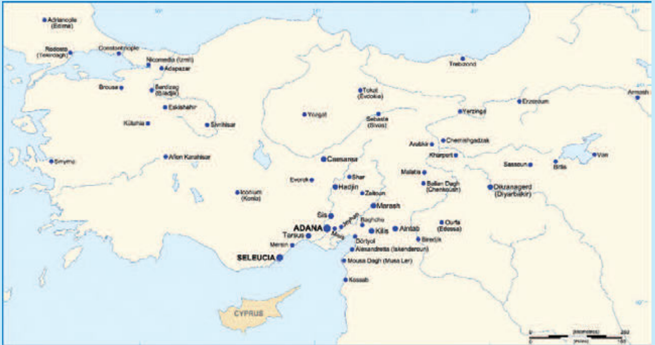
Map showing places of origin of Armenian-Cypriots

Map designed by Alexander-Michael Hadjilyra