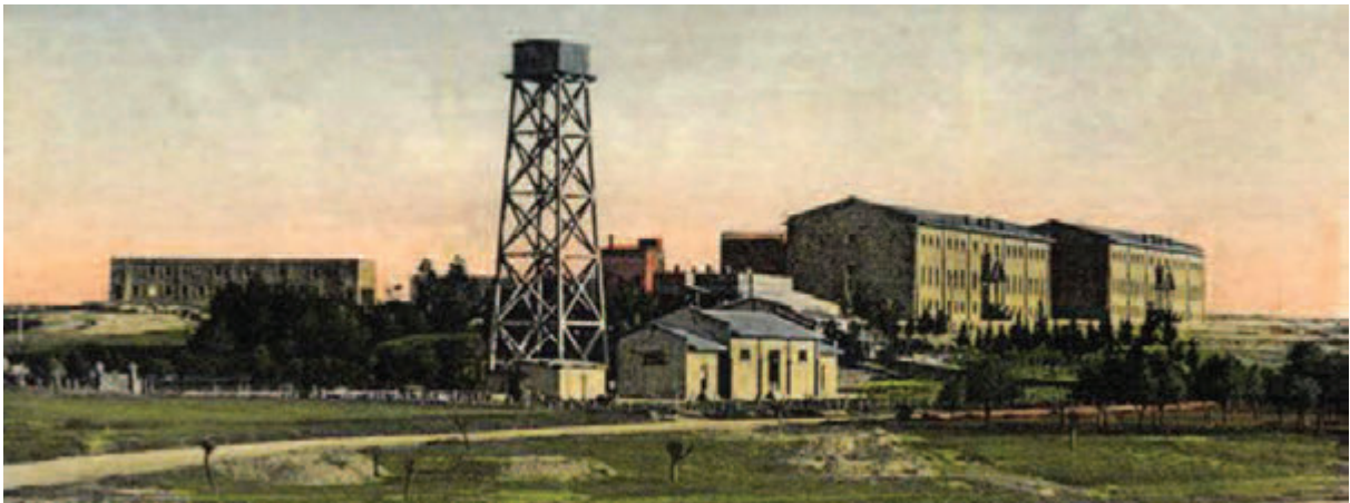
● Post-card showing the then newly-built Melkonian Educational Institute (1926).

number of Armenians in Cyprus increased significantly after the massive deportations, the horrific massacres and the Genocide perpetrated by the Ottomans and the Young Turks (1894-1896, 1909 & 1915-1923). Cyprus widely opened its arms to welcome over 10.000 refugees from Cilicia, Smyrna and Constantinople, who arrived in Larnaka and all the other harbours, some by chance, others by intent; about 1.500 of them made Cyprus their new home. Industrious, cultivated and