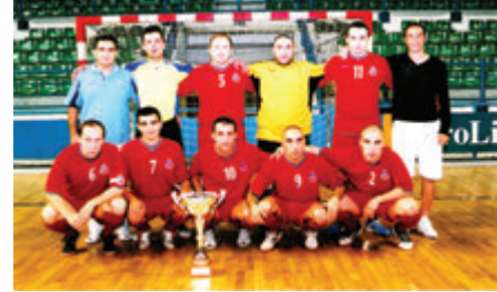
• The champion and cup holder AGBU-Ararat futsal team (2007).