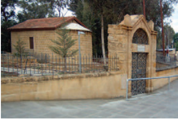
● Saint Paul's chapel and the impressive gate of the old Armenian cemetery in Nicosia (2010).