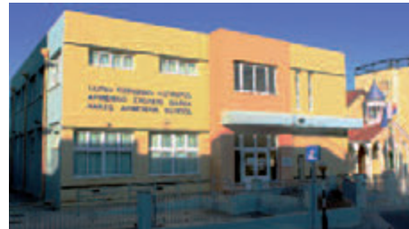
● Limassol's Nareg Armenian School. It shares its yard with the adjoining church of Saint George (2016).