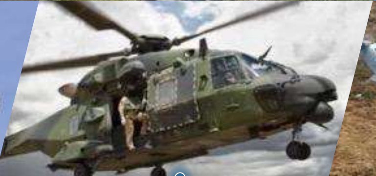
Forward Air MedEvac