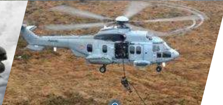
Utility | Tactical airlift